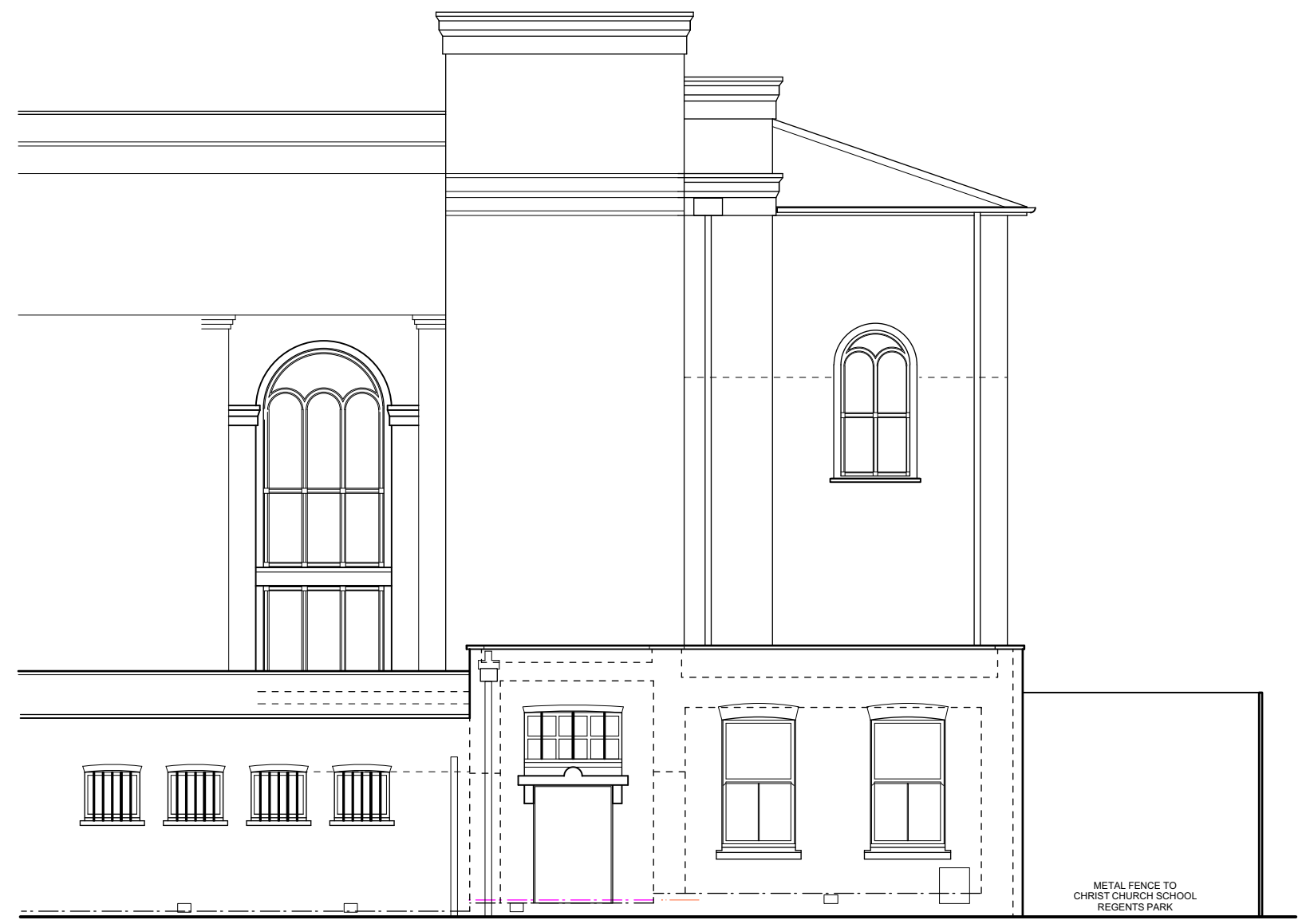
EXISTING LOCALISED EAST ELEVATION 1:100

NOTE: No dimensions are to be scaled from this drawing. All contractors must visit the site and be responsible for taking and checking all dimensions relative to this work. The designer must be notified of any discrepancies in writing.