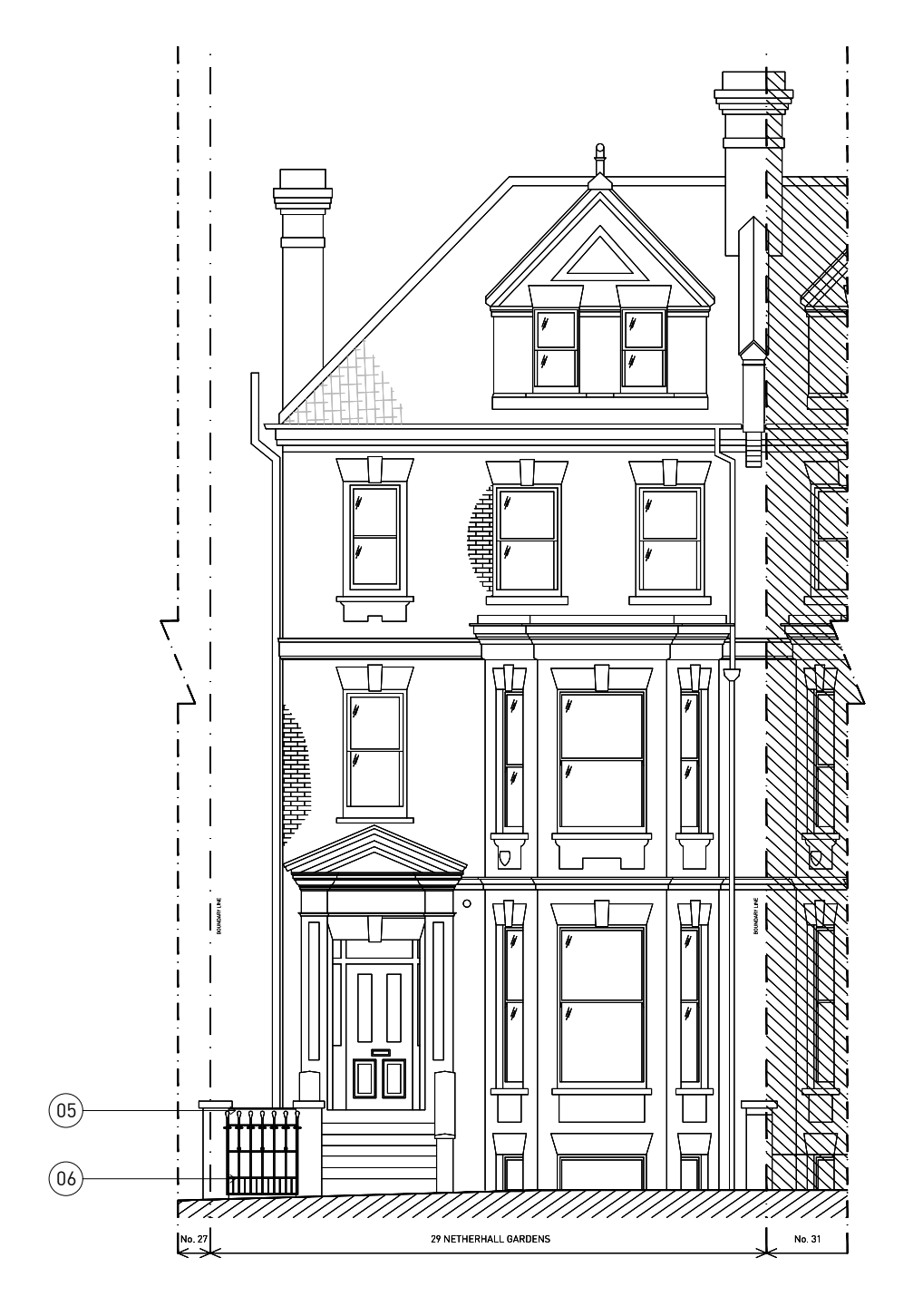
EXISTING STREET ELEVATION (FRONT) 1:50 @ A1 / 1:100 @ A3