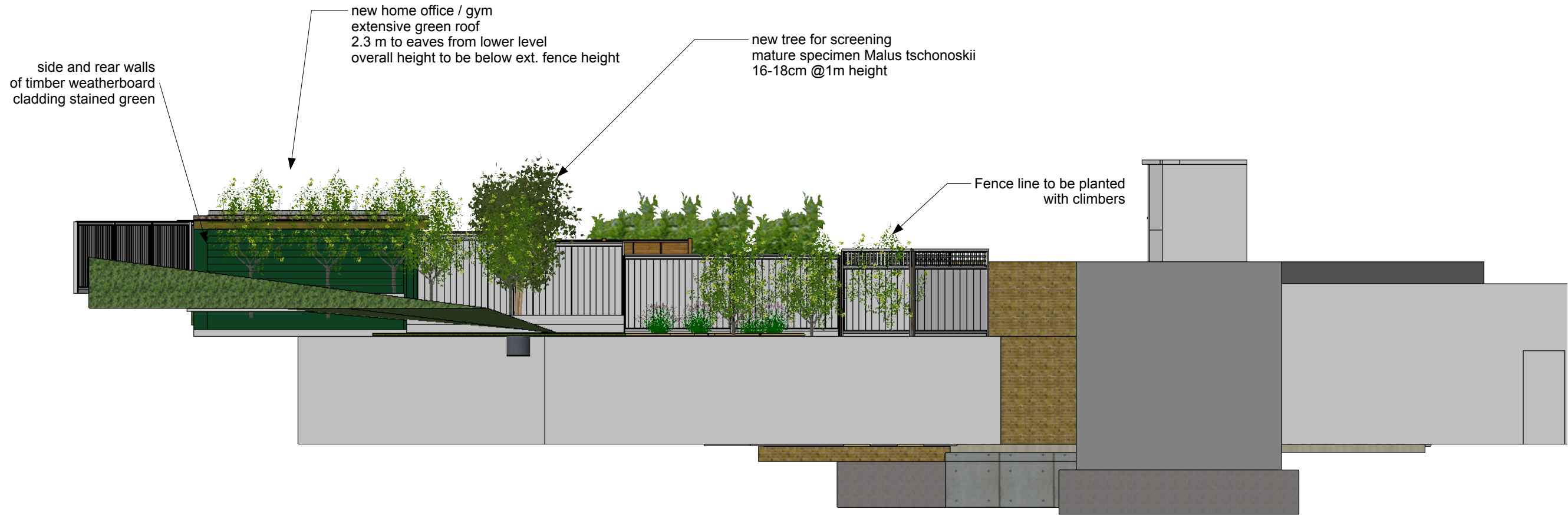
PROPOSED ELEVATION FROM GARDEN OF FLAT 2, 8 FROGNAL - FENCE BETWEEN FLATS 1 & 2 OMITTED TO SHOW HEIGHT OF PROPOSED OUTBUILDING