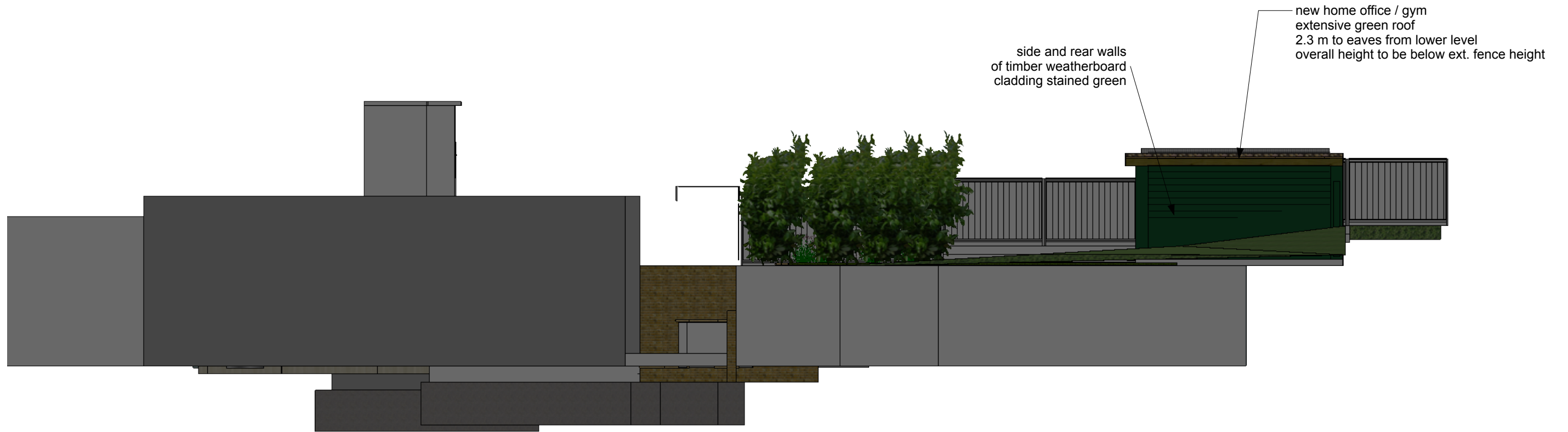
PROPOSED ELEVATION FROM ADJOINING GARDEN - FENCE BETWEEN FLATS 1 & 6 FROGNAL GARDEN OMITTED TO SHOW HEIGHT OF PROPOSED OUTBUILDING