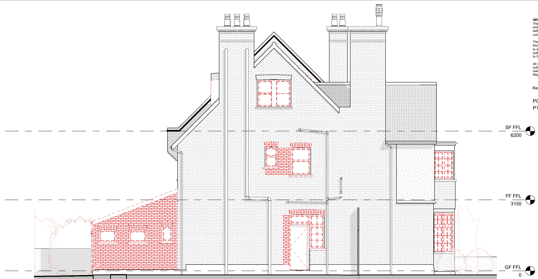
2 Existing Side Elevation 1 : 50

GENERAL NOTES. The Contractor to advise on all details and ensure stability and strength of construction. The contractor to provide setting out and rod drawings for approval prior to construction. The contractor to check all dimensions on site and relate to these drawings. The contractor to report any discrepancies to designers prior to construction. All services to local authorities, BCO & Environmental Health requirements and to Service Engineers. All structure to Structural Engineer's details and local authority and BCO requirements. All construction and materials to comply with the current Building and Fire Regulations.