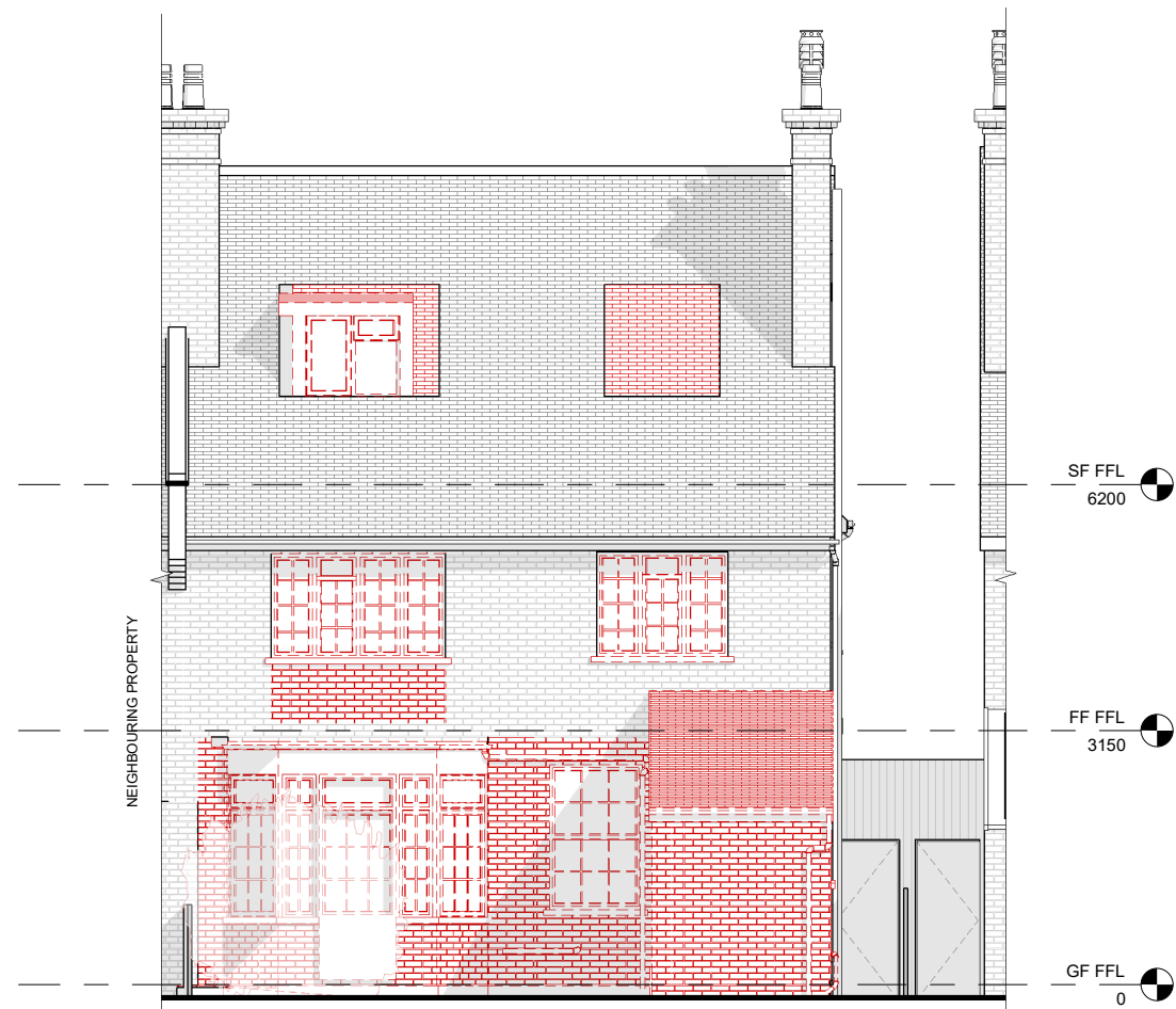
3 Existing Garden Elevation 1 : 50