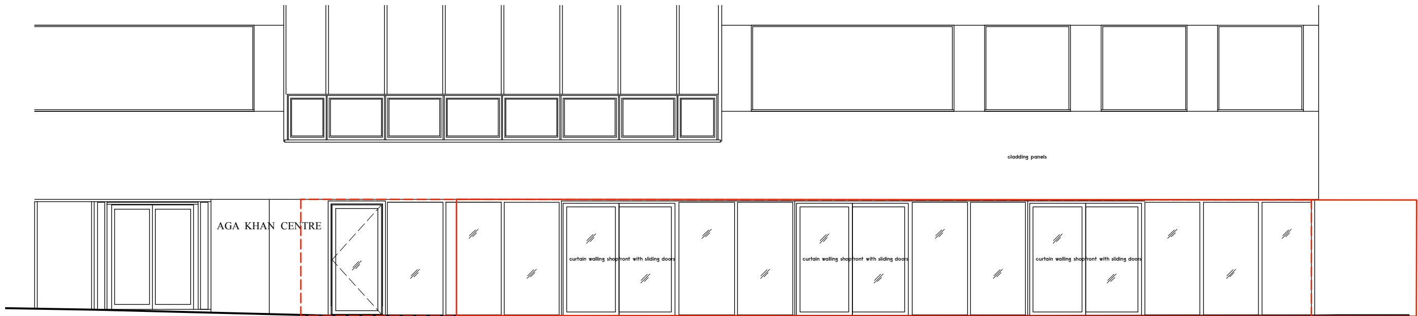
1 Existing External Elevation A Scale: 1:100

----- Dotted Red line - Internal demise _____ Solid Red line - External demise