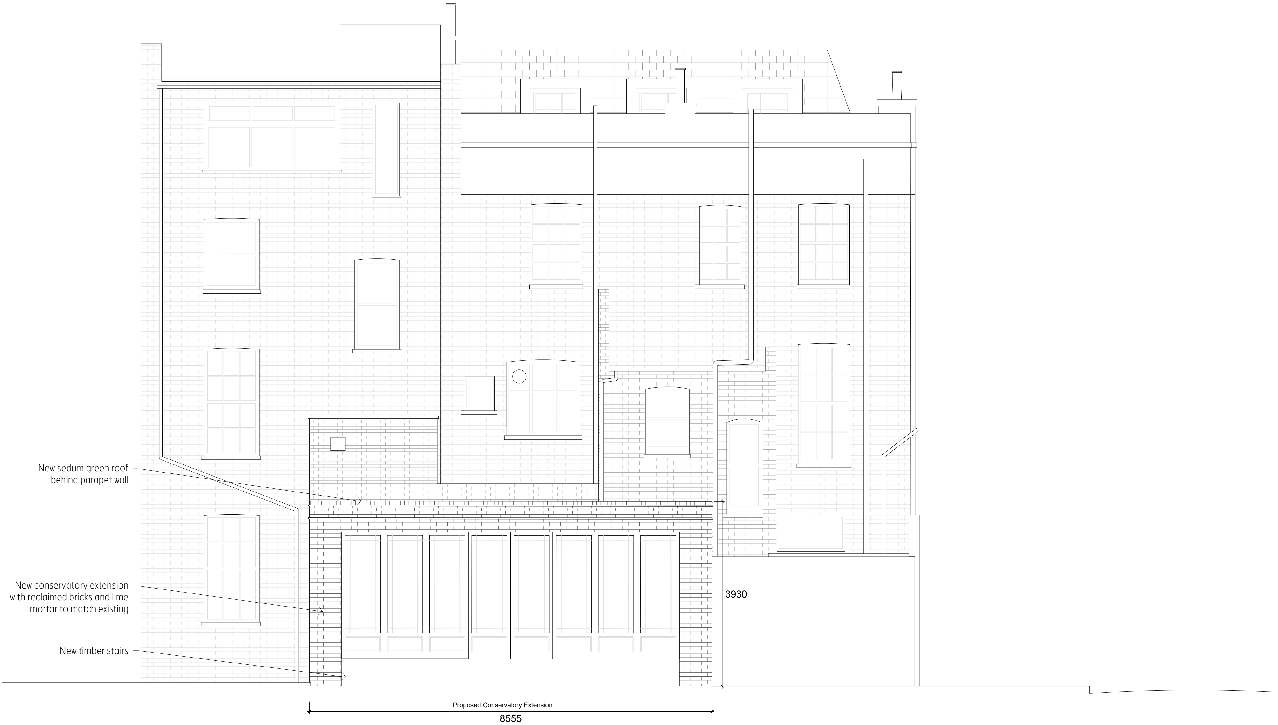
Proposed Rear Elevation 1:50 @ A1