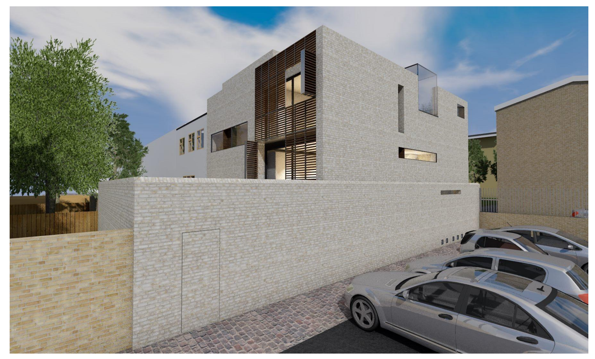
REAR VIEW FROM CAMDEN ROAD