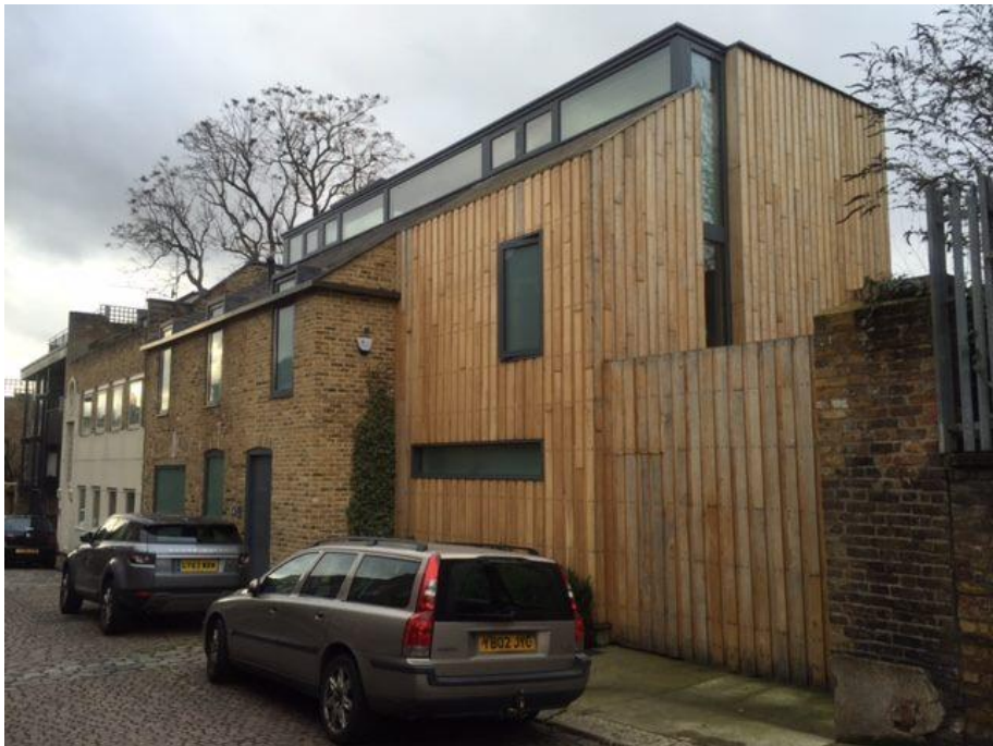
No 41 Camden Mews Timber cladding to recent planning approved 3 storey extension. This extension adjoins the Tesco car park and faces our proposed new house - so the timber clad houses face each other across the car park.