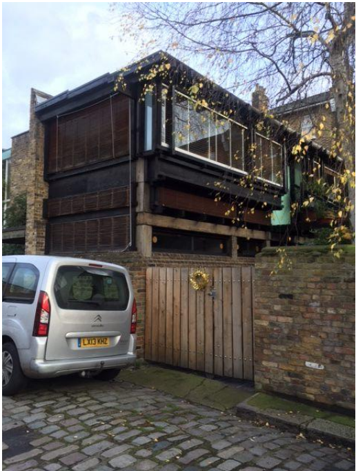
Timber framed grade 2 listed contemporary house at 62 Camden Mews