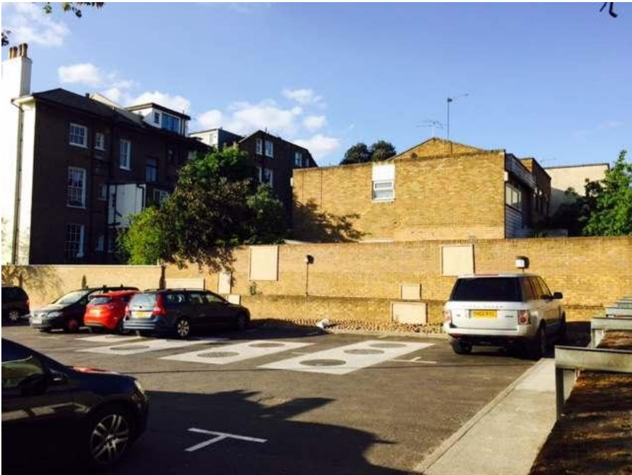
View ofsite from Tesco car park