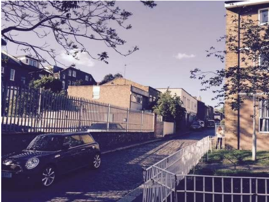
View up camden mews with Tesco car park on left and Abingdon Close flats on right