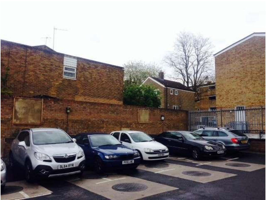
View of site from petrol station