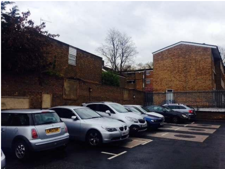
View to site from Tesco car park