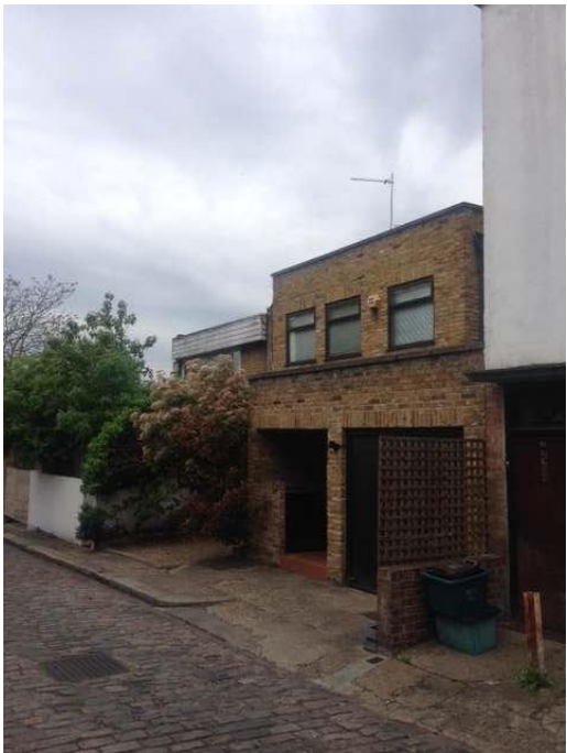
57 & 59 CAMDEN MEWS