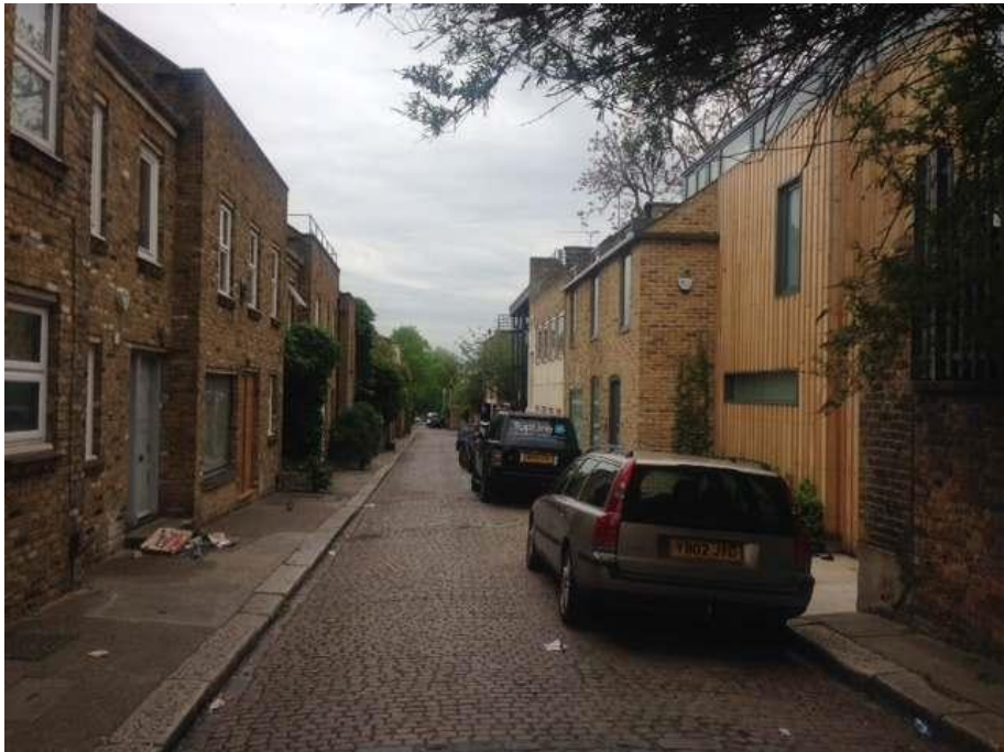
View down Camden Mews