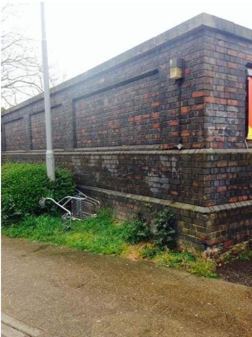
View of adjacent brick wall to railway ventilation shaft