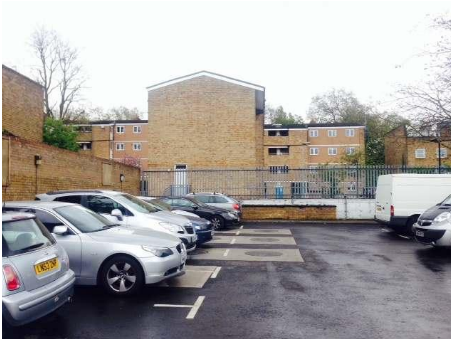
View to Abingdon Close from Tesco car park