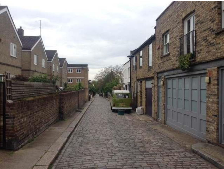
View from Camden Mews