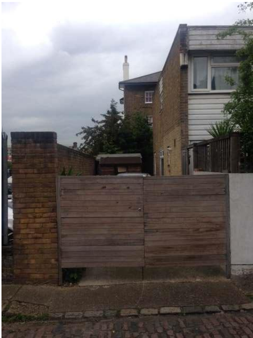
57 CAMDEN MEWS