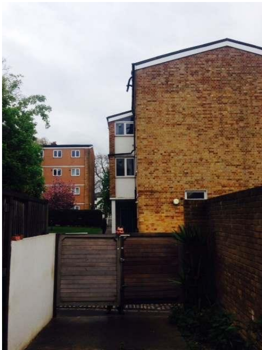
View from site to 36 Abingdon Close opposite