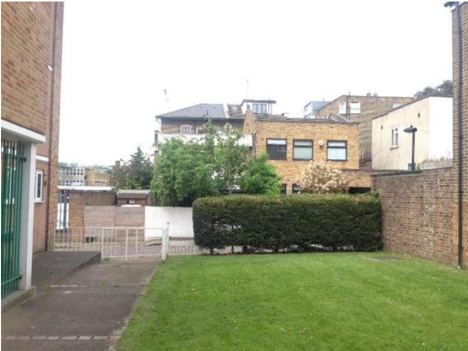
View from Abingdon Close

Notes: This drawing is the property and copyright of John Kerr Associates and written consent must be obtained before divulging to a third party or copying whole or part of the drawing by any method whatsoever. All dimensions are to be checked on site prior to construction. Any discrepancies are to be reported to the architect before works commence. All dimensions are in millimeters. Do not scale dimension. This drawing is to be read in conjunction with the specification and with all relevant consultants'/specialists' drawings and/or documents. All relevant Statutory Approvals to be obtained before works commence. revision date comments