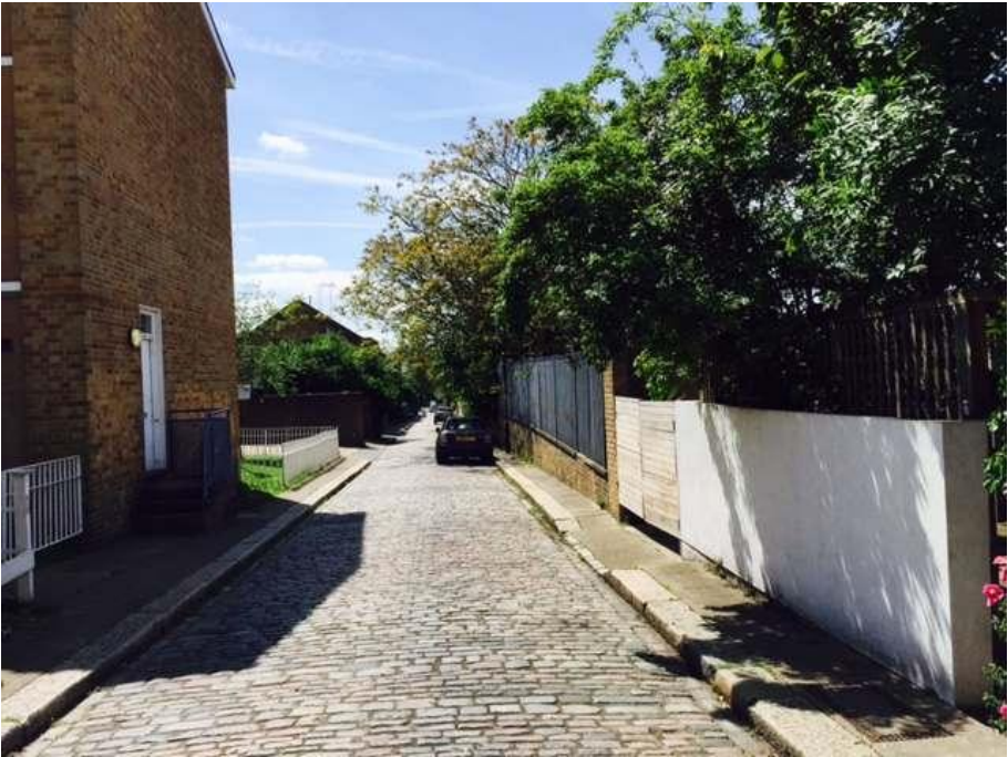
View down Camden Mews showing Abingdon Close flats opposite no 57 Camden Mews