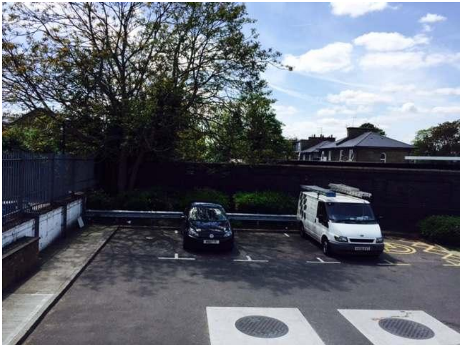
View from site across adjoining car park to railway tunnel