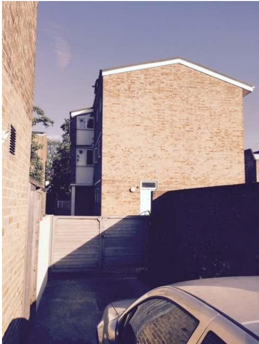
View from 57 Camden Mews to Abingdon Close flats opposite