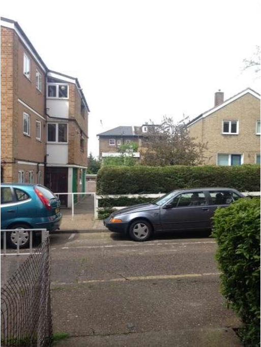
View from Camden Square