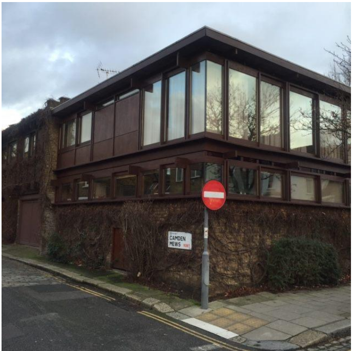
Timber framed construction over brick 'plinth' to house on corner of Camden Mews and Murray Street