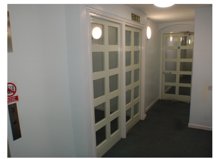
Typical 1st - 3rd Floor - Flat Entrance Door (3rd Floor shown)