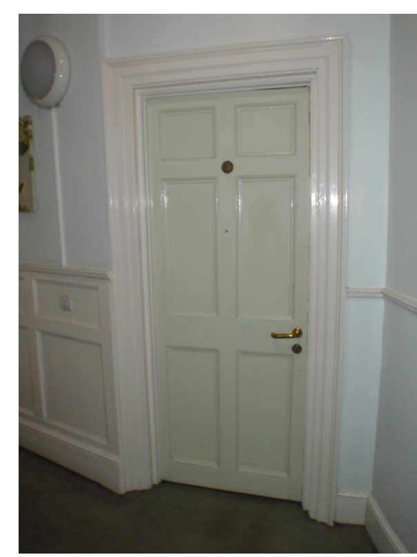
Ground Floor - Existing Flat 3 Entrance Door

Proposed - Office & Flat 3 Entrance Door - To be upgraded using Envirograf intumescent coatings, to maintain the appearance of the doors. Location Ref. A