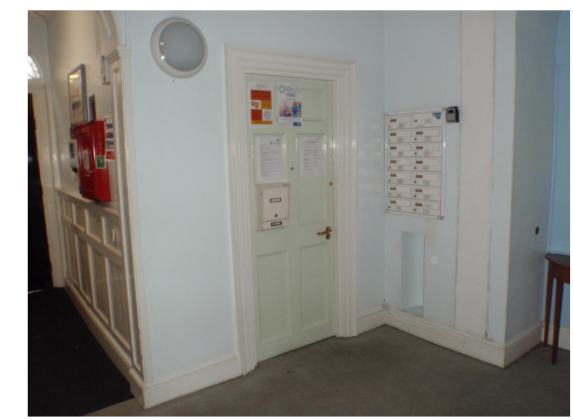
Ground Floor - Existing Office Door