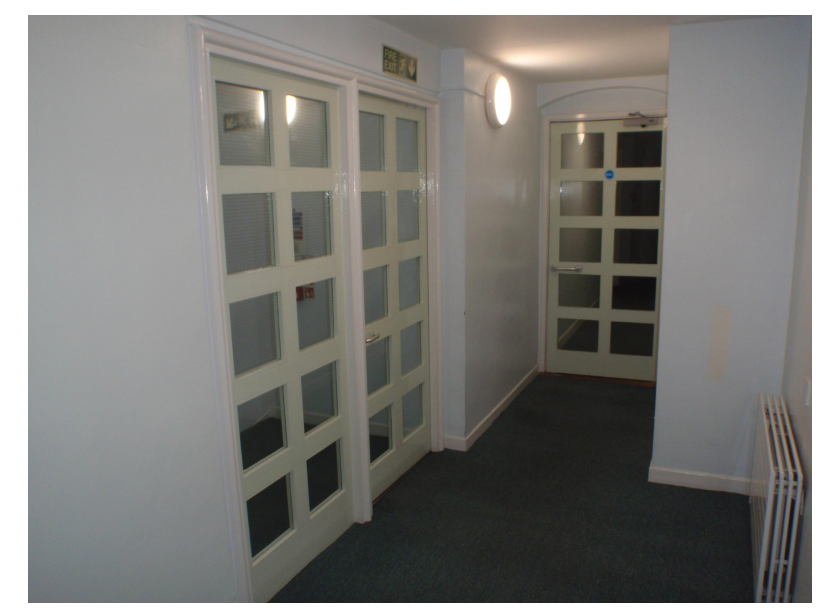
Existing 2nd Floor Stair Landing Door and Screen & Typical Single Fire Door to stairwells and corridors