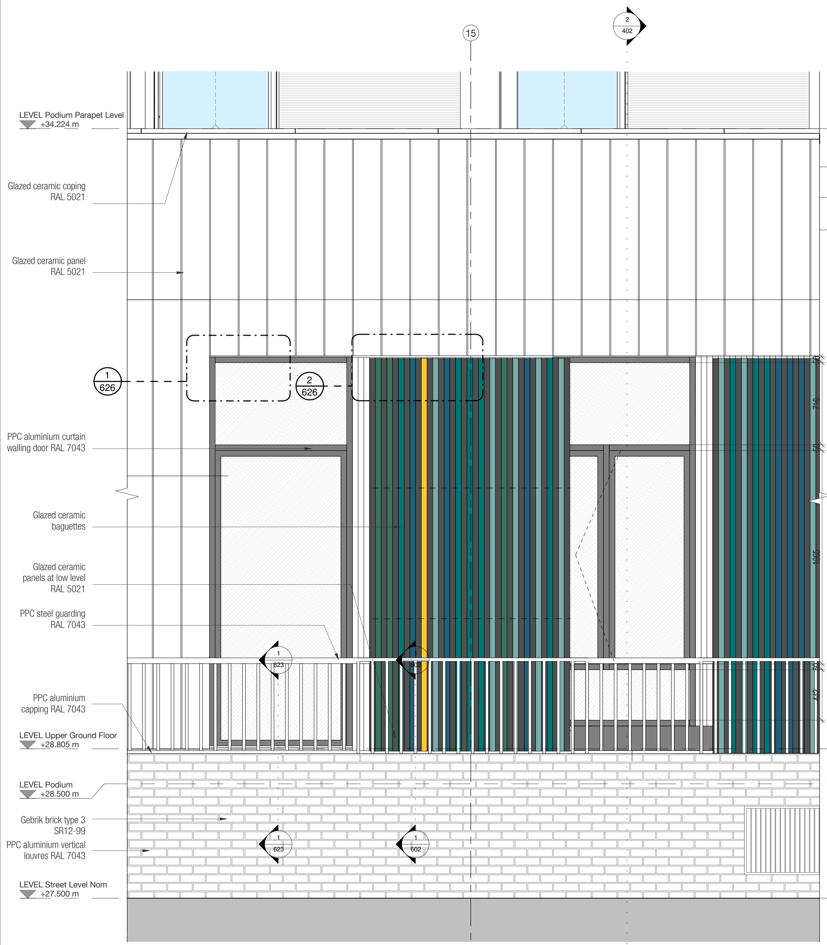
Bay Study 2 - Bedroom Elevation

Note: This is a colour drawing, in order to ensure any subsequent reproduction is viewed correctly it is to be re-printed in full colour