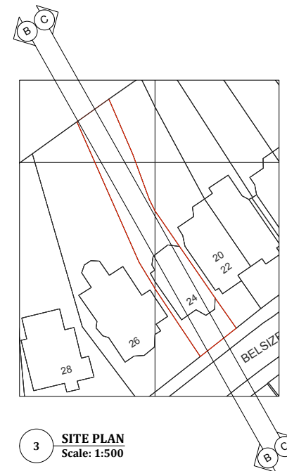
3 SITE PLAN Scale: 1:500