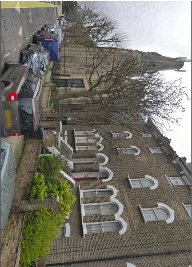
CHURCH STUDIOS VUE NORTH FROM NORTH TERRACE