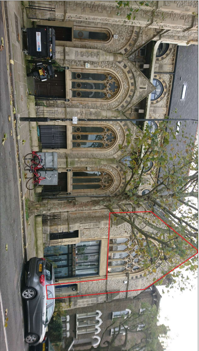
CHURCH STUDIOS FRONT ELEVATION FROM NORTH TERRACE EXTENT OF FLAT 10 SHOWN IN RED OUTLINE NOTE: NO PROPOSED ELEVATIONAL CHANGES