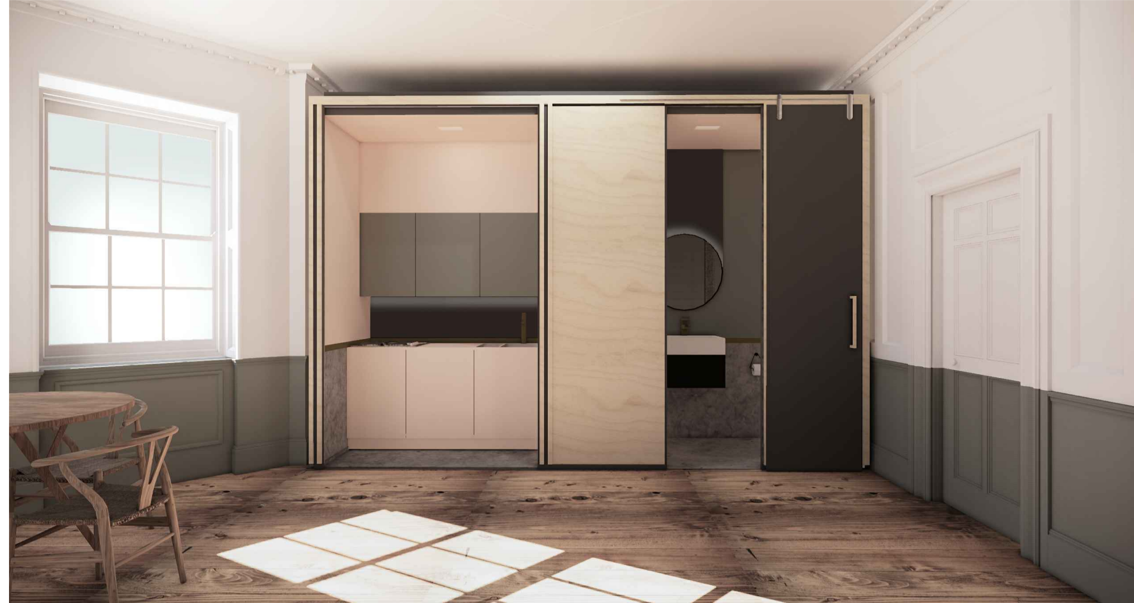
02 Typical Kitchen/Shower Pod Indicative Visual With Doors Open