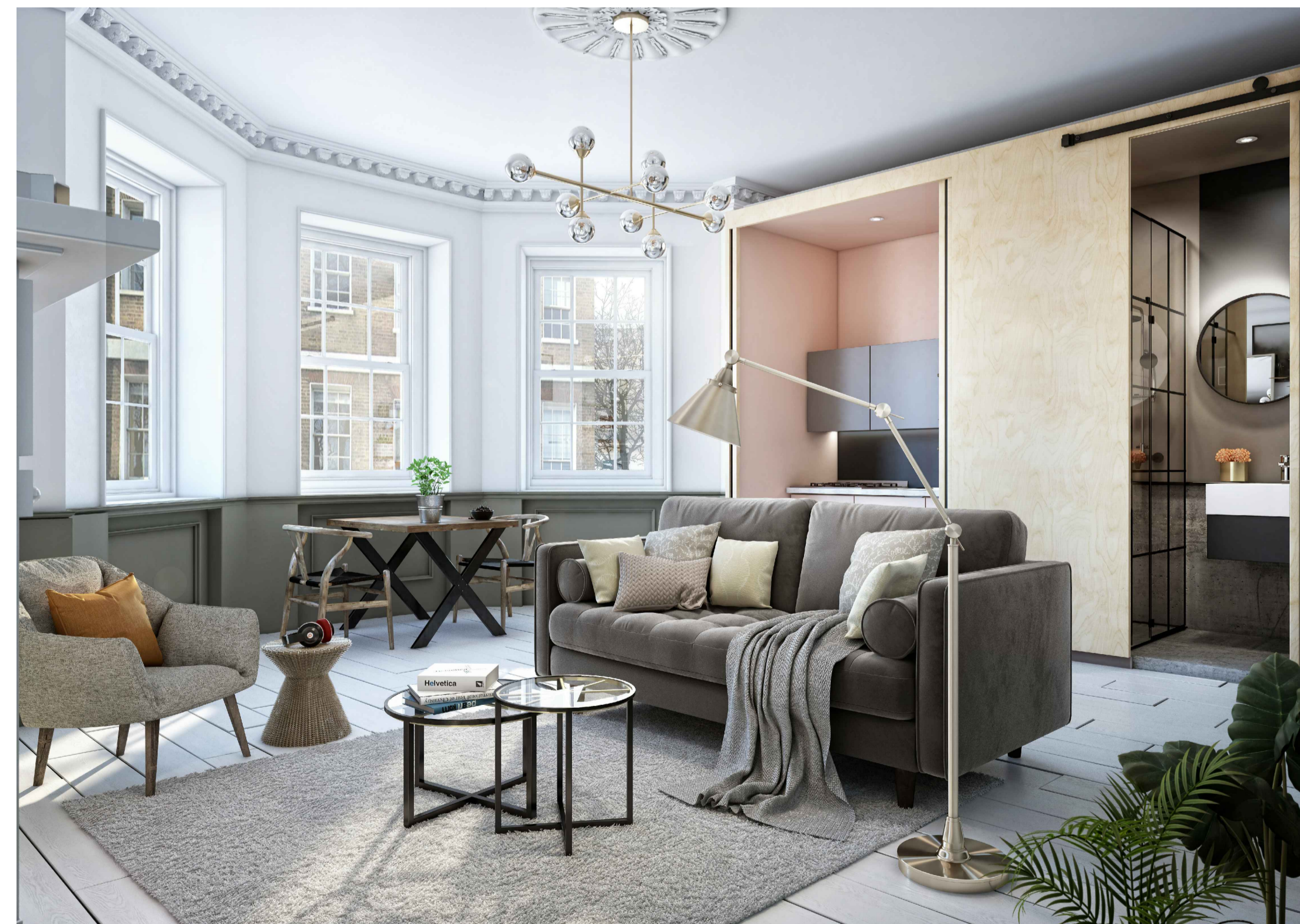
03 Living Room Indicative Visual