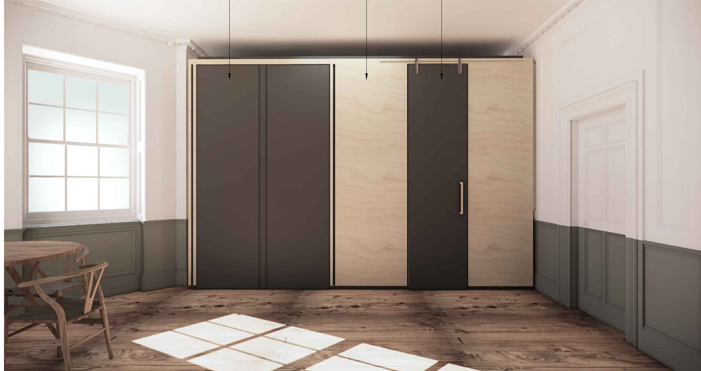
01 Typical Kitchen/Shower Pod Indicative Visual With Doors Closed

Dark grey spray laquered double pivot/slide doors