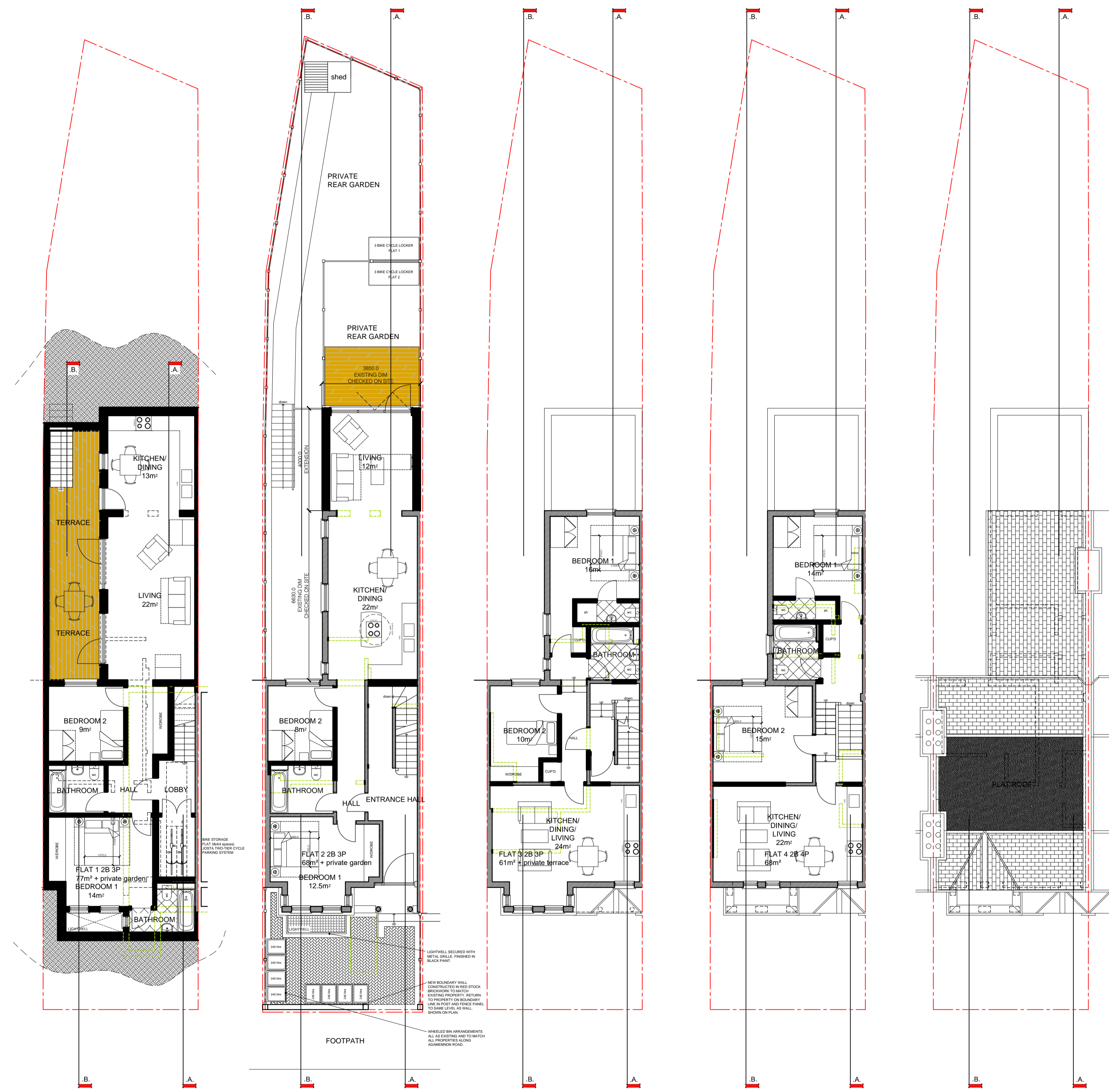
BASEMENT PLAN 1:100 GROUND FLOOR PLAN 1:100 FIRST FLOOR PLAN 1:100 SECOND FLOOR PLAN 1:100 ROOF PLAN 1:100

All dimensions to be checked on site and any discrepancies reported to the Architect/Contract Administrator before proceeding with the works on site, or off-site fabrication SITE AREA 217 SQM