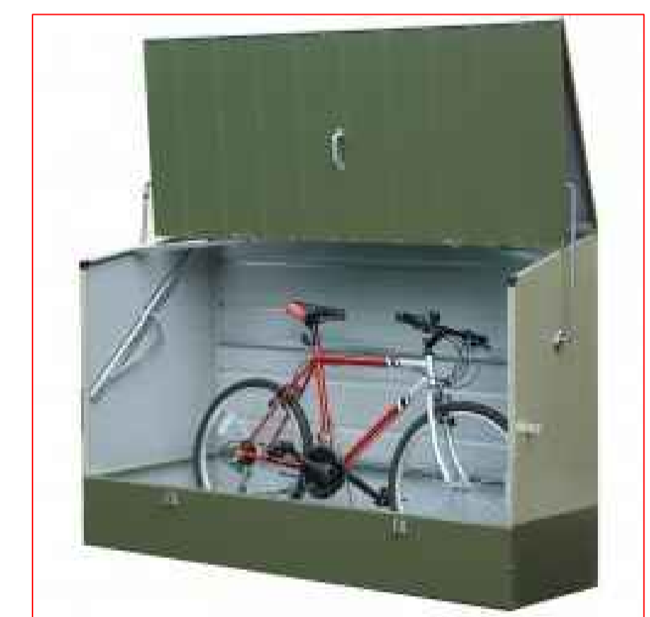
IMAGE OF TRIMETALS BICYCLE STORAGE UNIT

CYCLE STORAGE 8 NUMBER CYCLE STORAGE POSITIONS INDICATED. CYCLE STORAGE TO BE COVERED AND SECURE IN LINE WITH CPG7 TRIMETALS BICYCLE STORAGE STORES UPTO 3 ADULT BIKES H133XW196XD90cm