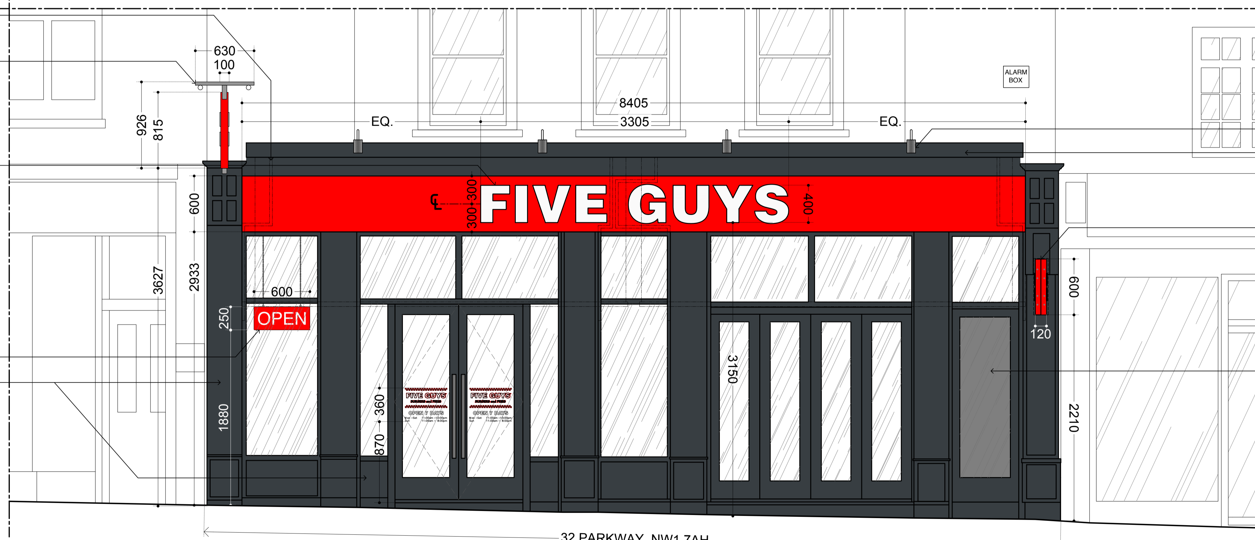
02 SHOPFRONT ELEVATION B - FULLY RETRACTED AWNING SCALE 1:50 @ A3

EXISTING SHOPFRONT TO BE PAINTED IN BLACK (Colour Ref no: RAL 7016 Anthracite Grey - 30% Gloss)