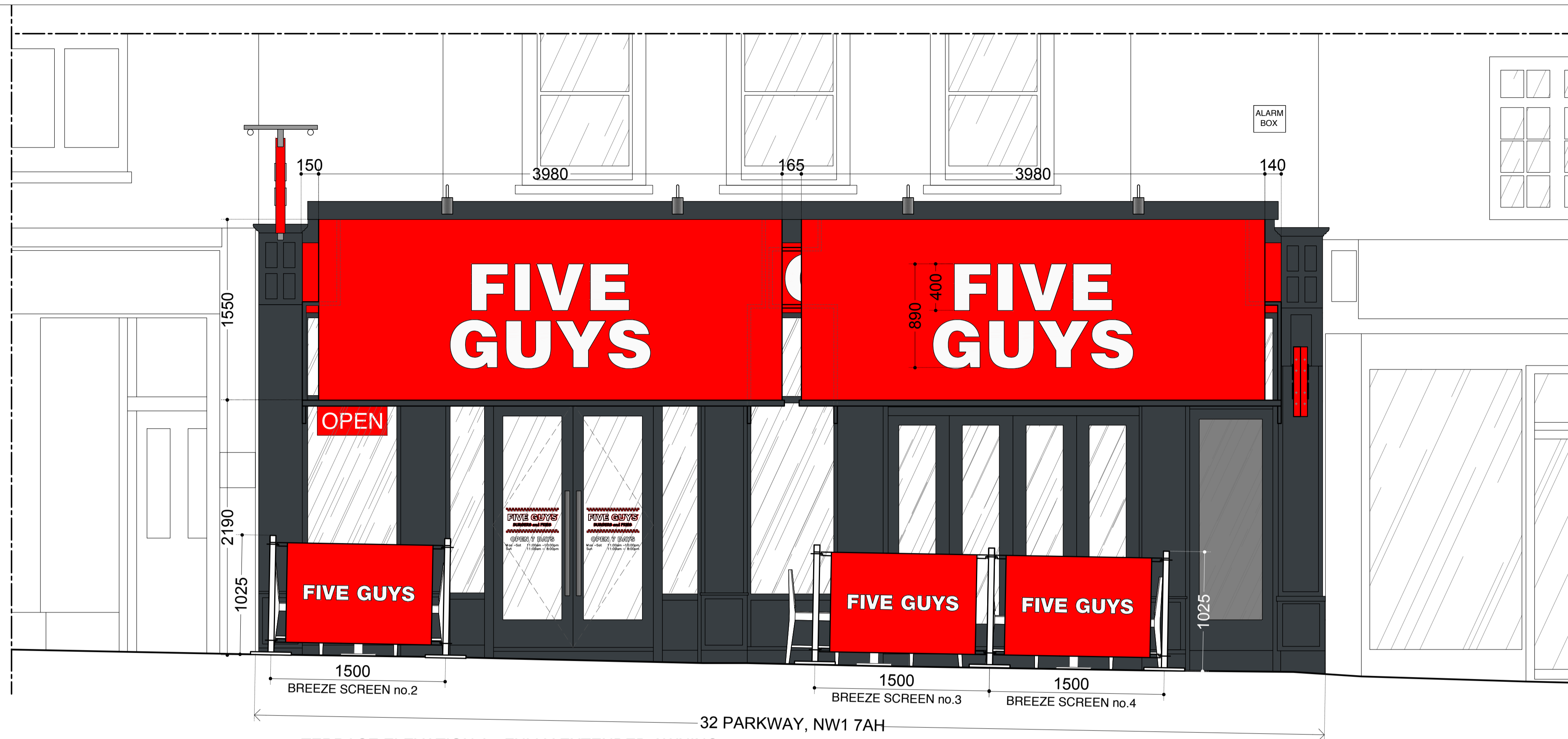
01 TERRACE ELEVATION A - FULLY EXTENDED AWNING SCALE 1:50 @ A3