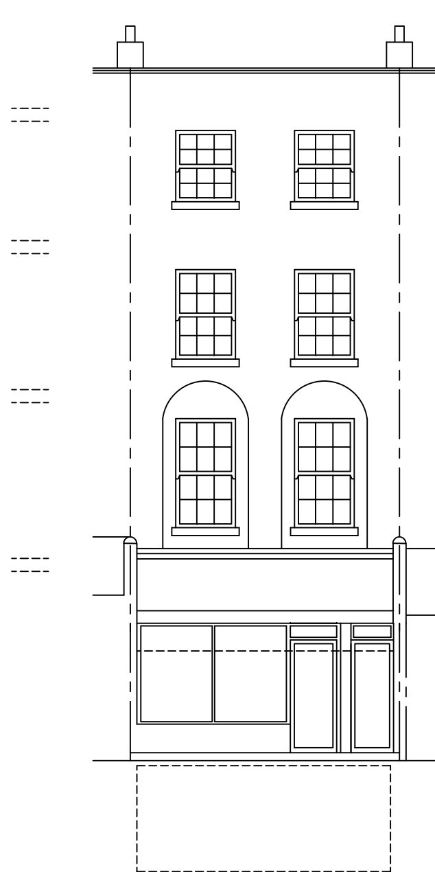
EXISTING FRONT ELEVATION (NO CHANGES PROPOSED)