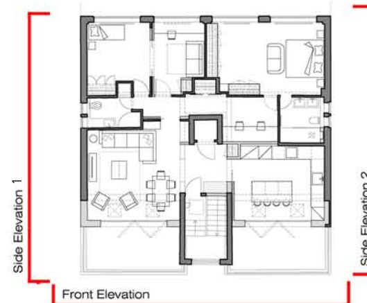
PROPOSED Key Plan PA-03