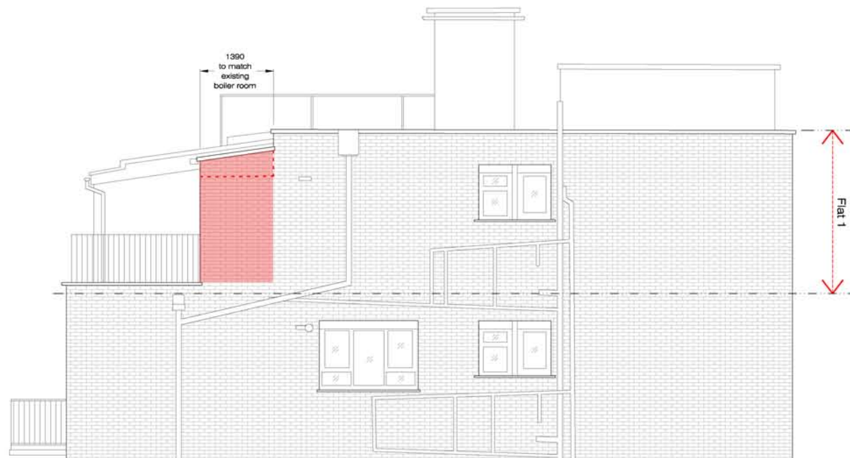
PROPOSED Side Elevation 2 (Flat 1) SCALE 1:100@A3 PA-03