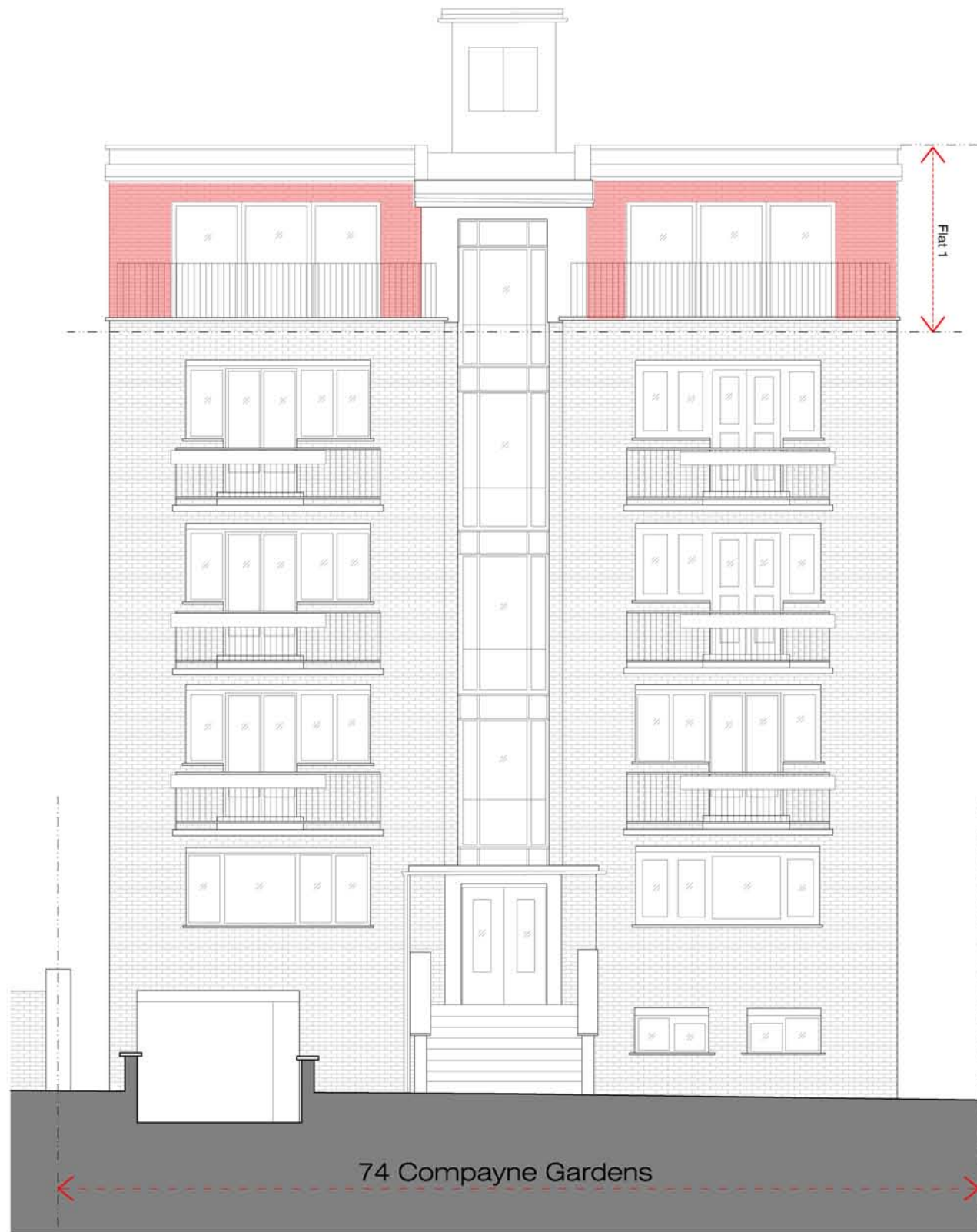
PROPOSED Front Elevation (Flat 1) SCALE 1:100@A3 PA-03