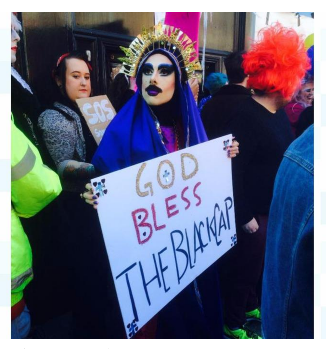
Scores of people took to the streets of Camden today in protest

London's drag community donned their most flamboyant outfits today to protest against the closure of one of the city's most iconic gay venues.