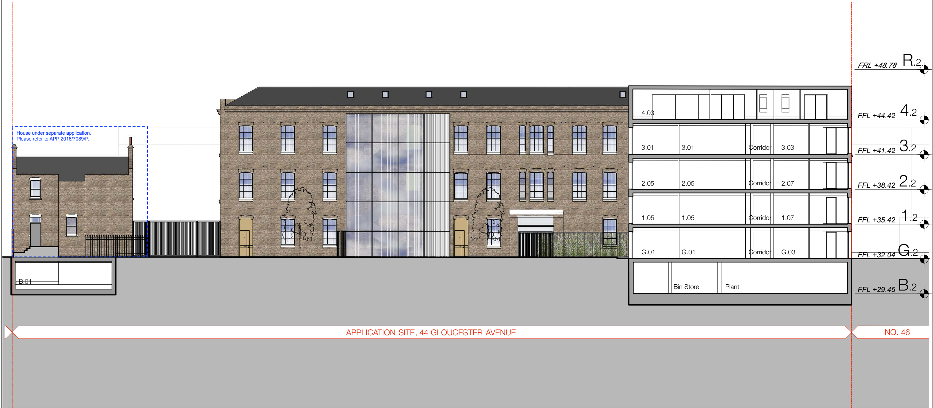
A GS.01 Proposed Section CC 1:100 @A1 1:200 @A3

Information contained within this drawing is the sole copyright of 21st Architecture Ltd. and is not to be reproduced without express permission. No implied license exists. This drawing not to be used for land transfer or valuation purposes. Do not scale from this drawing. All dimensions & levels are to be checked on site by the contractor. Issued for purposes indicated only. Drawing errors and omissions to be reported to the architect.