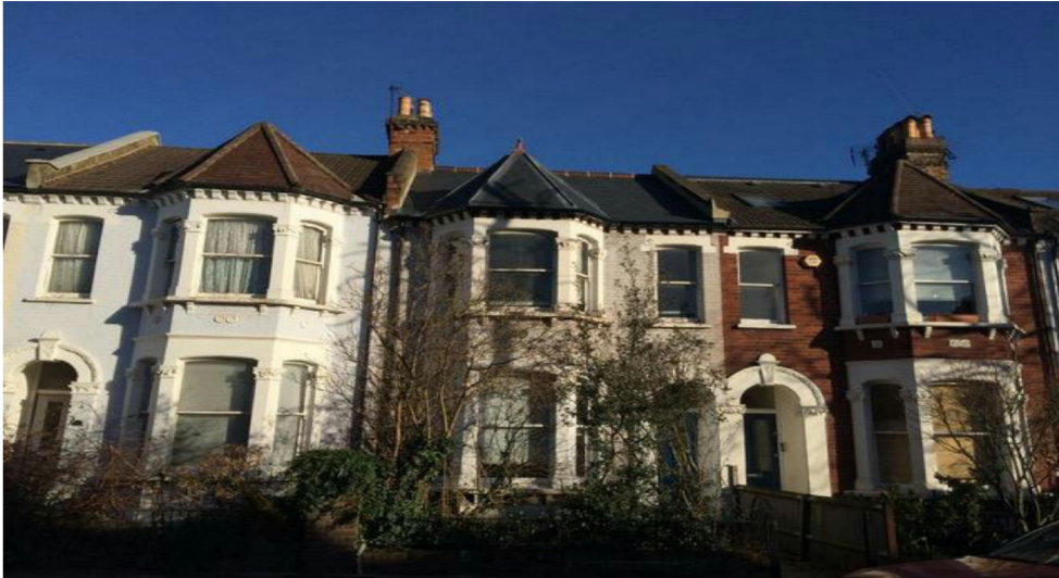
Photograph 1. Front elevation

Existing soft and hard landscaping of front garden at 13 Kylemore Road,