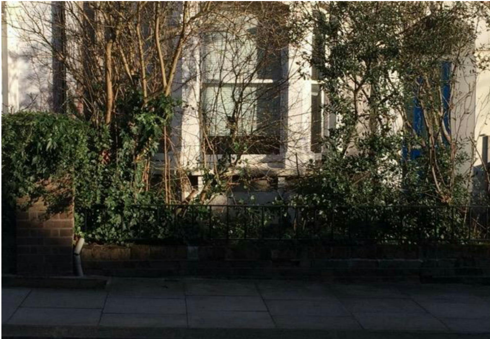
Photograph 2. Front Boundary