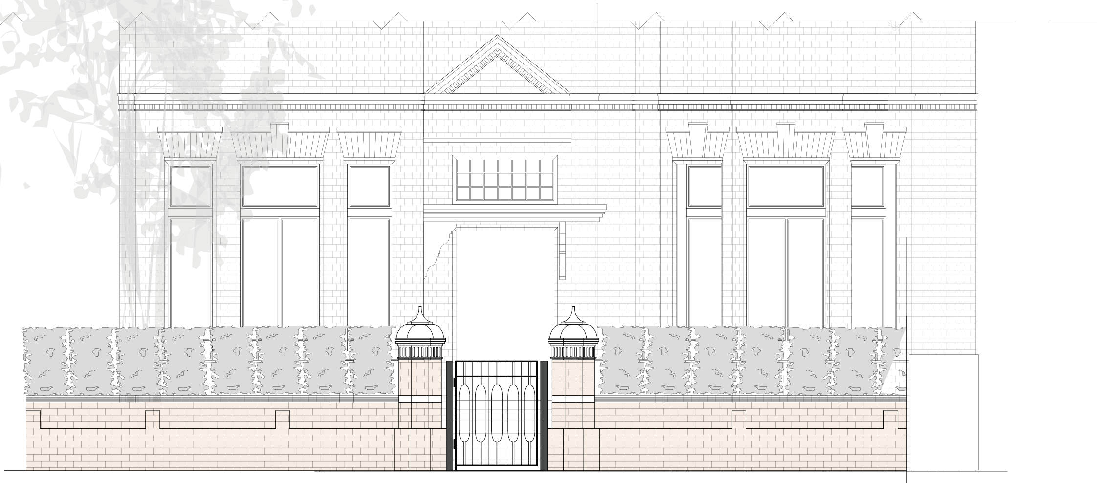
EXISTING ELEVATION STREET VIEW SCALE 1 : 50