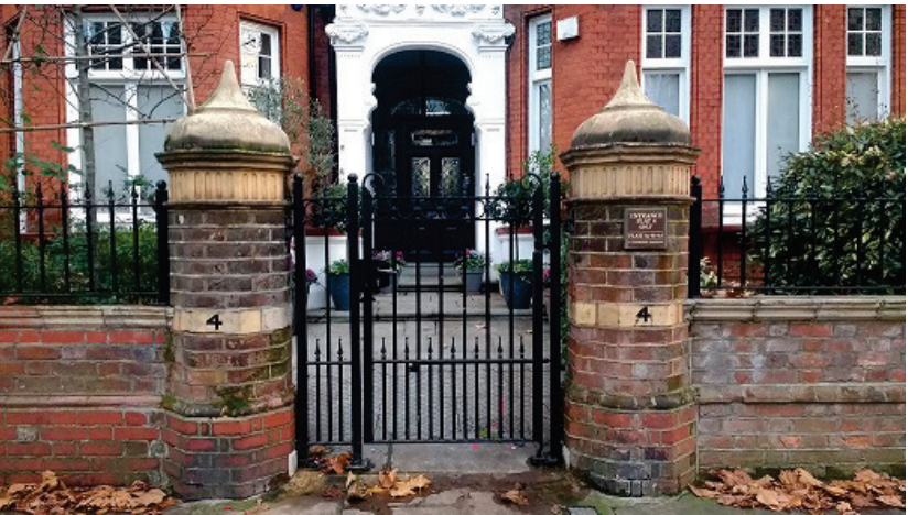
GATE AND RAILING AT NO.4 LYNDHURST GARDENS

NEW WROUGHT IRON GATE TO EXISTING OPENING. DESIGN TO BE CONFIRMED AND TO BE IN KEEPING WITH VICTORIAN ORIGINAL STYLE AND WITH OTHER GATES WITHIN STREET. SEE: www.thevictorianemporium.com