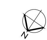
I EI.25, EI.26 & EI.22 Existing Room Plan 93251 1:25 @ A1