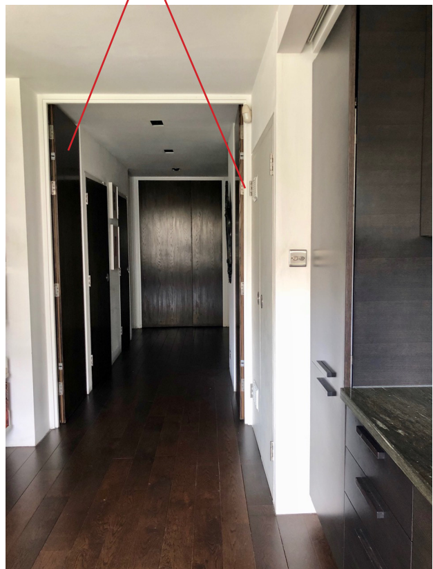
Existing hallway viewed from kitchen (existing separating doors held back by magnetic holders, connected to flat's fire alarm)