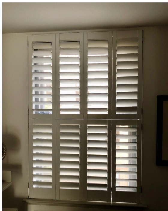
Rear windows of flat, showing removable timber shutters