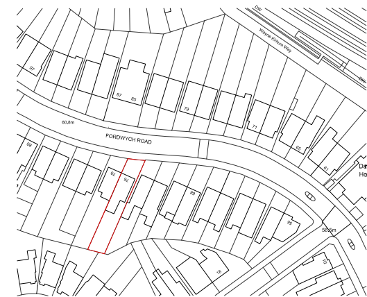
02 SITE LOCATION PLAN Scale 1:1250 @ A1, 1:2500 @ A3