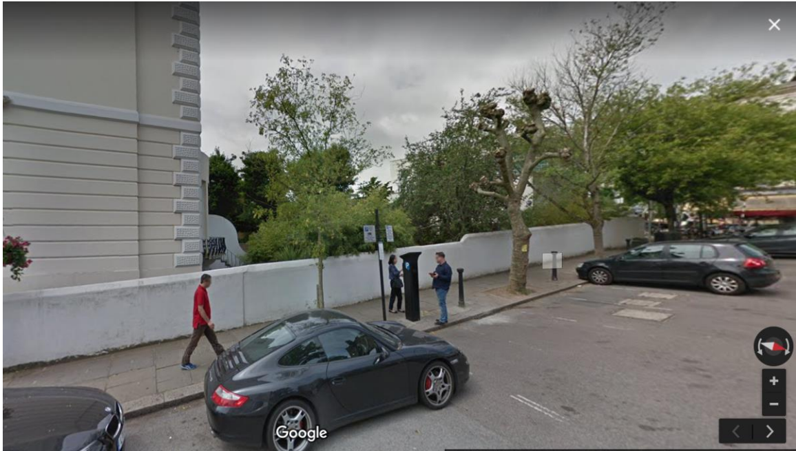
Photograph 2: View towards rear garden of 49 Belsize Lane from Belsize Terrace