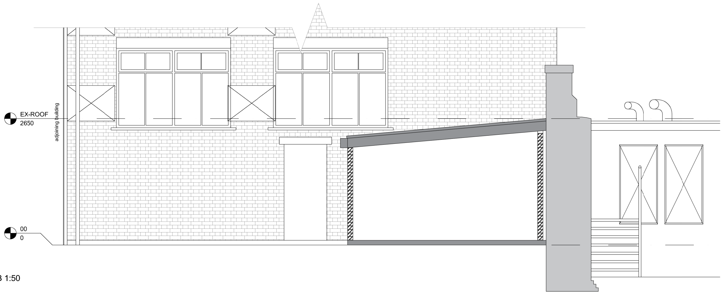
EXISTING SECTION B 1:50 Medical Store

Copyright. All Rights Reserved. This work is copyright and cannot be produced or copied in any form or by any means (graphic, electronic or mechanical including photocopying) without the written permission of the originator. Any license, express or implied, to use this document or any purpose whatsoever is restricted to the terms of the agreement or implied agreement between the originator and the instructing party. DO NOT SCALE FROM THIS DRAWING. WORK ONLY FROM FIGURED DIMENSIONS. THIS DRAWING TO BE READ IN CONJUNCTION WITH RELEVANT CONSULTANT'S DRAWINGS.