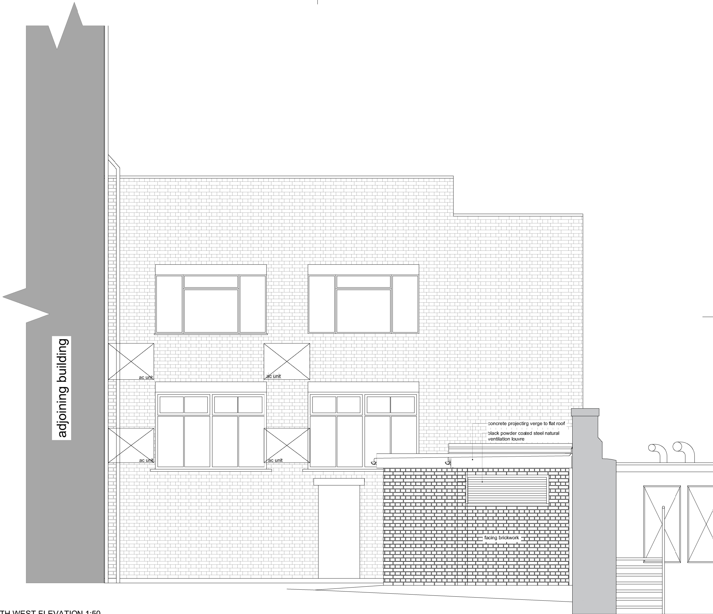
PROPOSED NORTH WEST ELEVATION 1:50 SUB STATION

Copyright. All Rights Reserved. This work is copyright and cannot be produced or copied in any form or by any means (graphic, electronic or mechanical including photocopying) without the written permission of the originator. Any license, express or implied, to use this document or any purpose whatsoever is restricted to the terms of the agreement or implied agreement between the originator and the instructing party. DO NOT SCALE FROM THIS DRAWING. WORK ONLY FROM FIGURED DIMENSIONS. THIS DRAWING TO BE READ IN CONJUNCTION WITH RELEVANT CONSULTANT'S DRAWINGS.