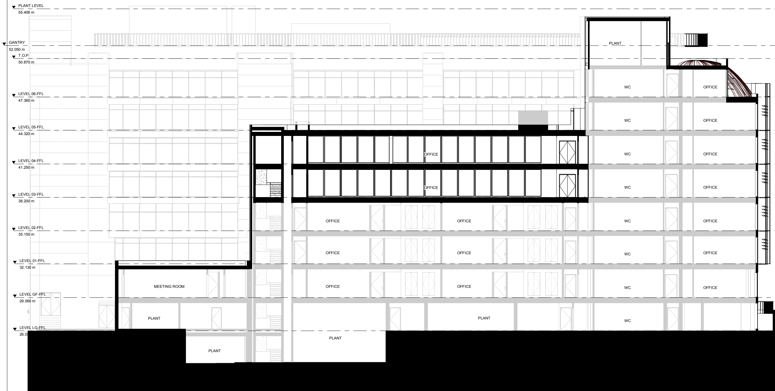
1 PROPOSED - SECTION B-B 1 : 100

NOTE: Internal layouts for illustrative purposes