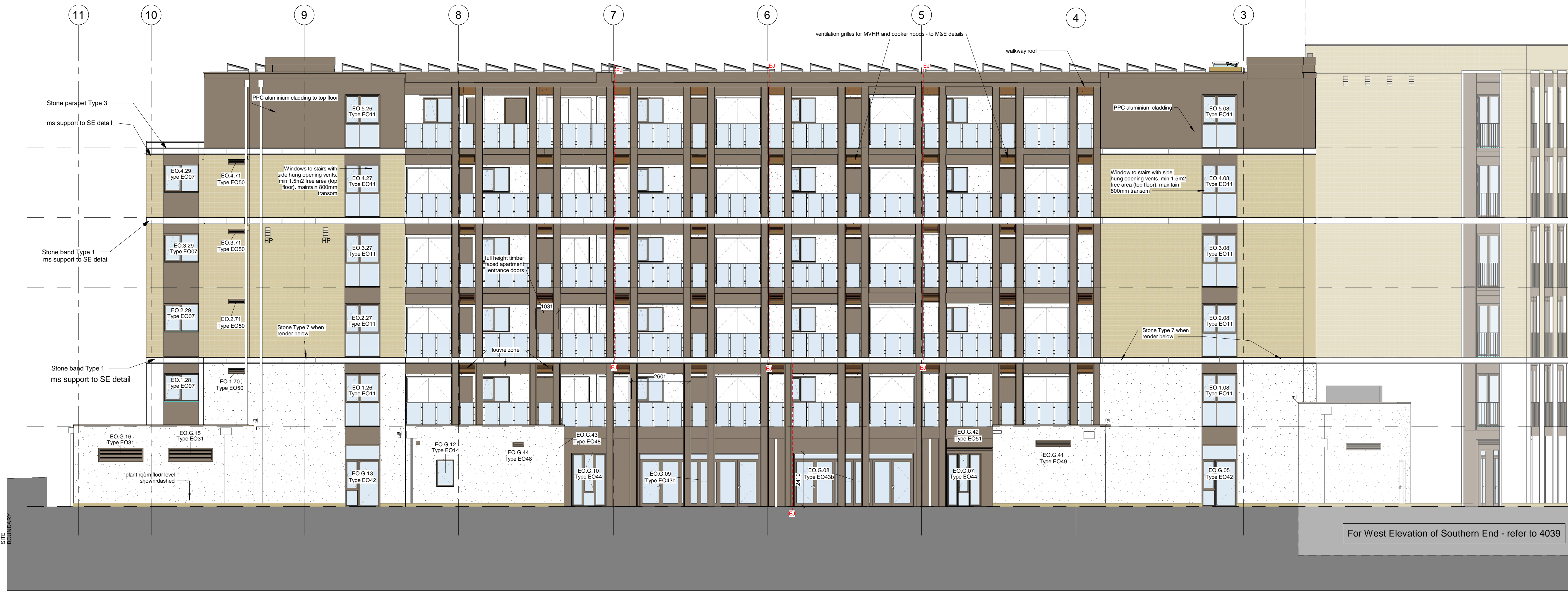
5 | West Main Elevation 1 : 100

SBD BOX LEGEND 5 No ST. Sparrow Teraed Dimensions: 100mm (w) 100mm (h) 100mm (d) SP Schwinger Sparrow Teraed surface mounted or wall approved 5 No SB. Swift Box Newman Box Dimensions: 100mm (w) 140mm (h) 140mm (d) No. 16 Schwinger Swift Box surface mounted or wall approved GB. Generalist bird box Dimensions: Storm entrance hole will attract Great Blue, Marsh, Coal and Cuckoo, TL, Redstart, Nuthatch, Colaptes and Red Flycatcher, Wren, Tree and House Sparrows and Gold 18 Schwinger Nest Box for mounting on trees or wall approved BATS BOX LEGEND 3 No HB. Habitat Bat Box Six Bat boxes 65 by Wildlife or equal approved 4 No Bat boxes 65 by Wildlife or equal approved