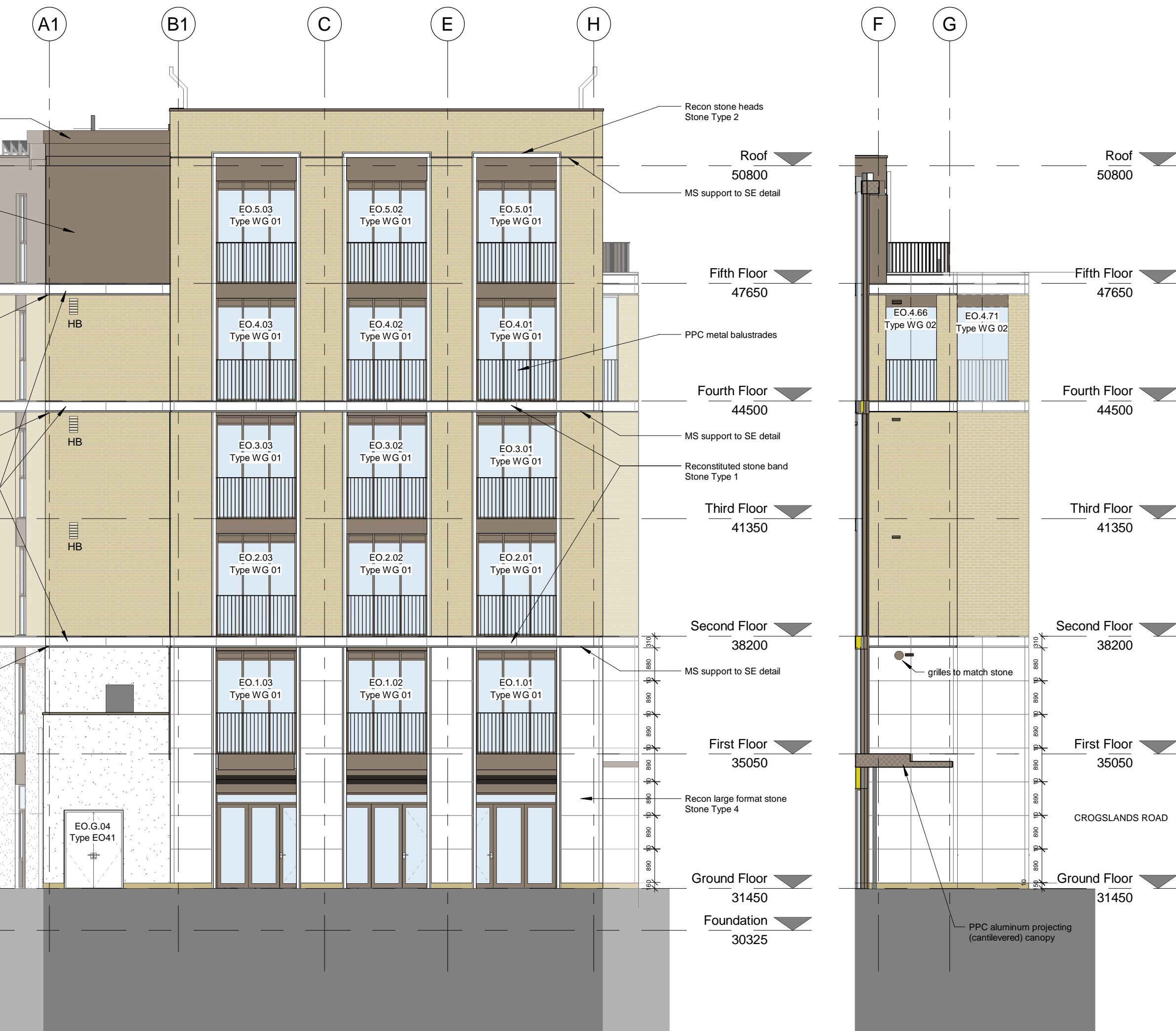
3 | South Main Elevation 1 : 100