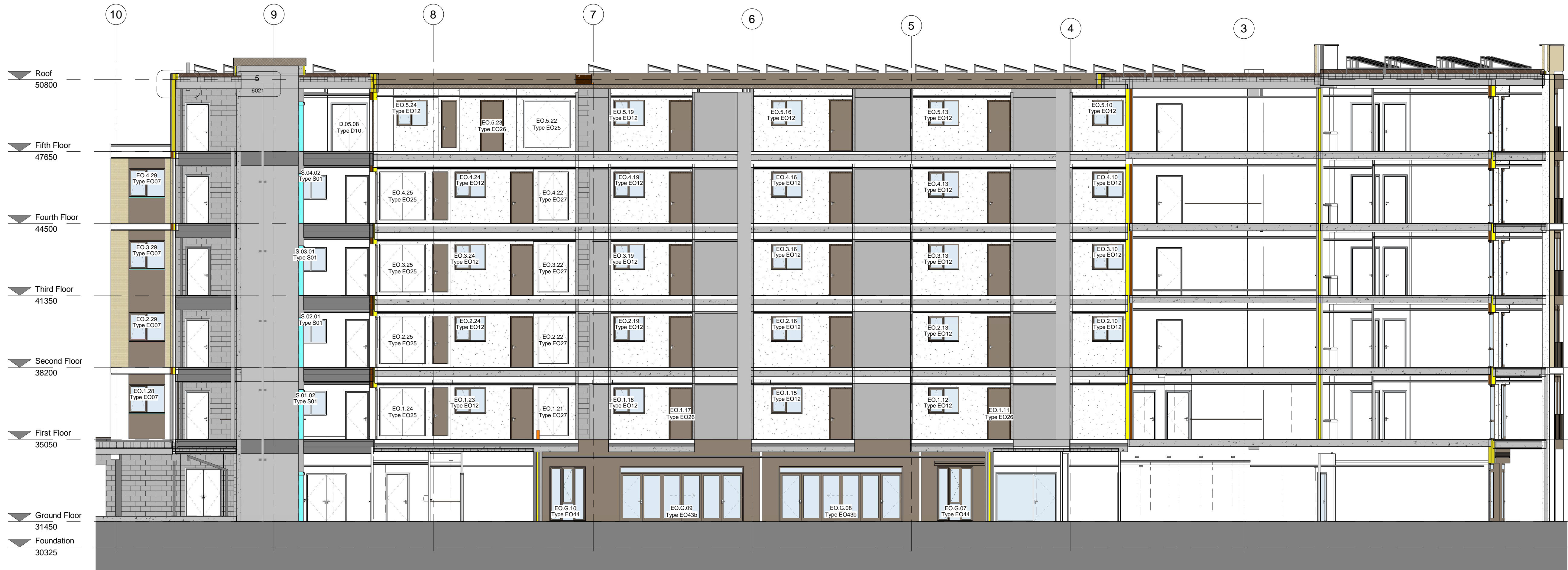
2 | Internal West Elevation 1 : 100