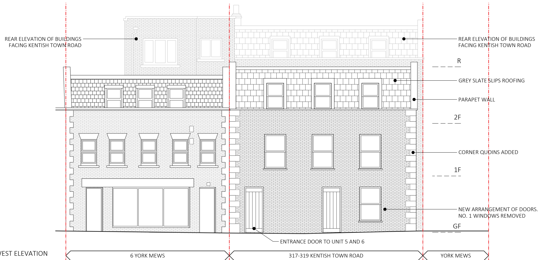
PROPOSED WEST ELEVATION SCALE 1:100