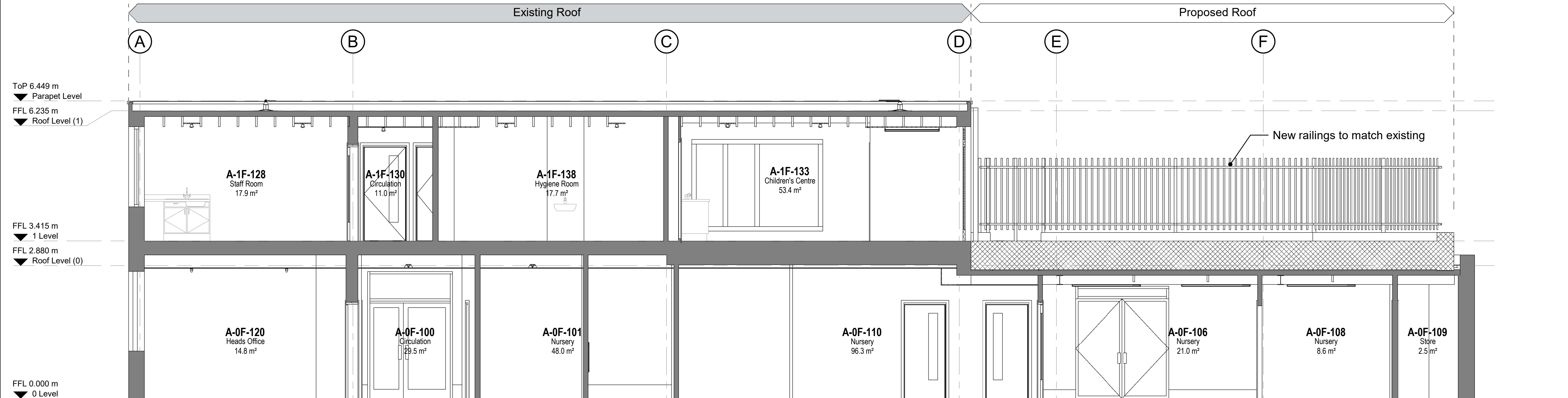
2 Proposed Section BB 0651 1 : 50