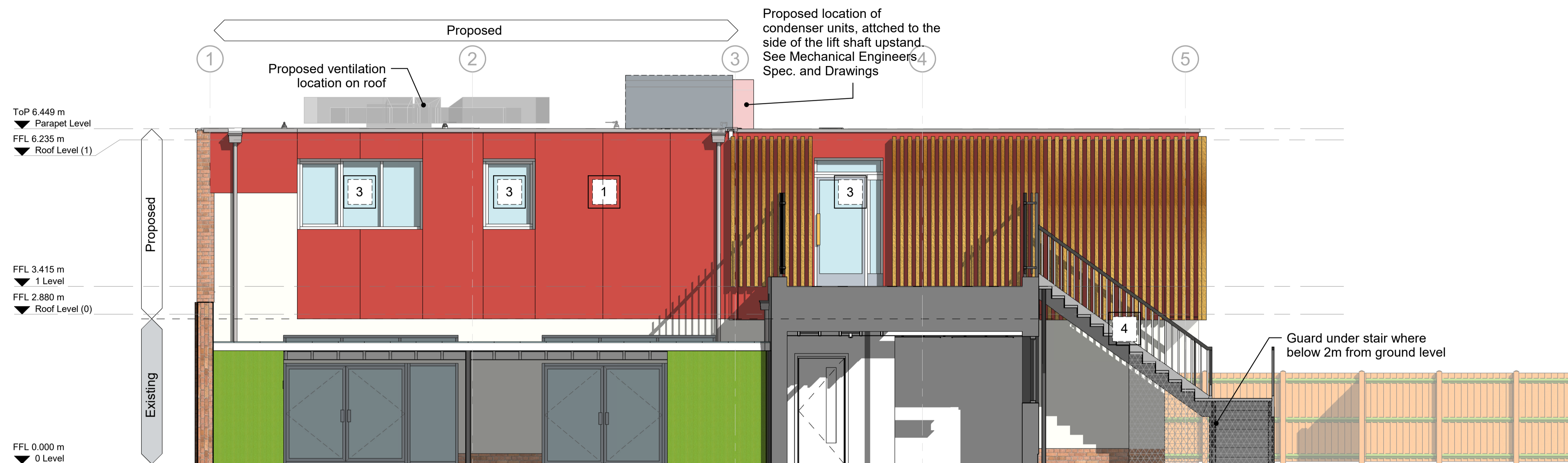
1 Proposed West Elevation 0552 1 : 50