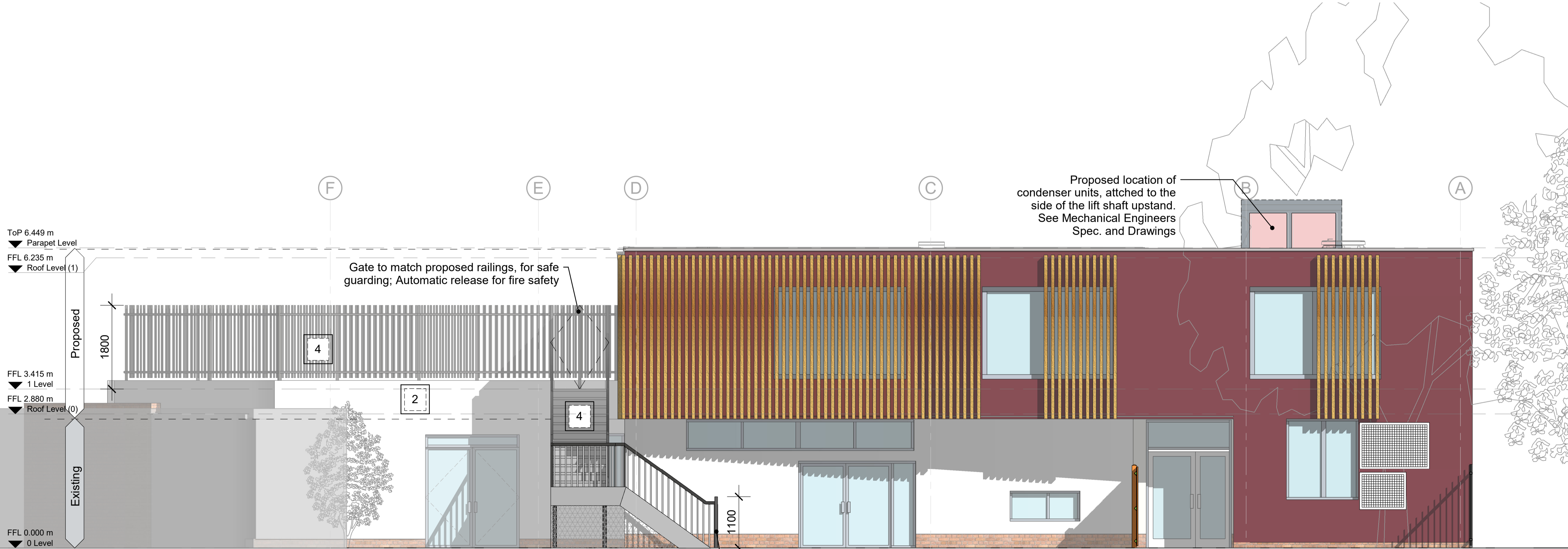
2 Proposed South Elevation 0551 1 : 50