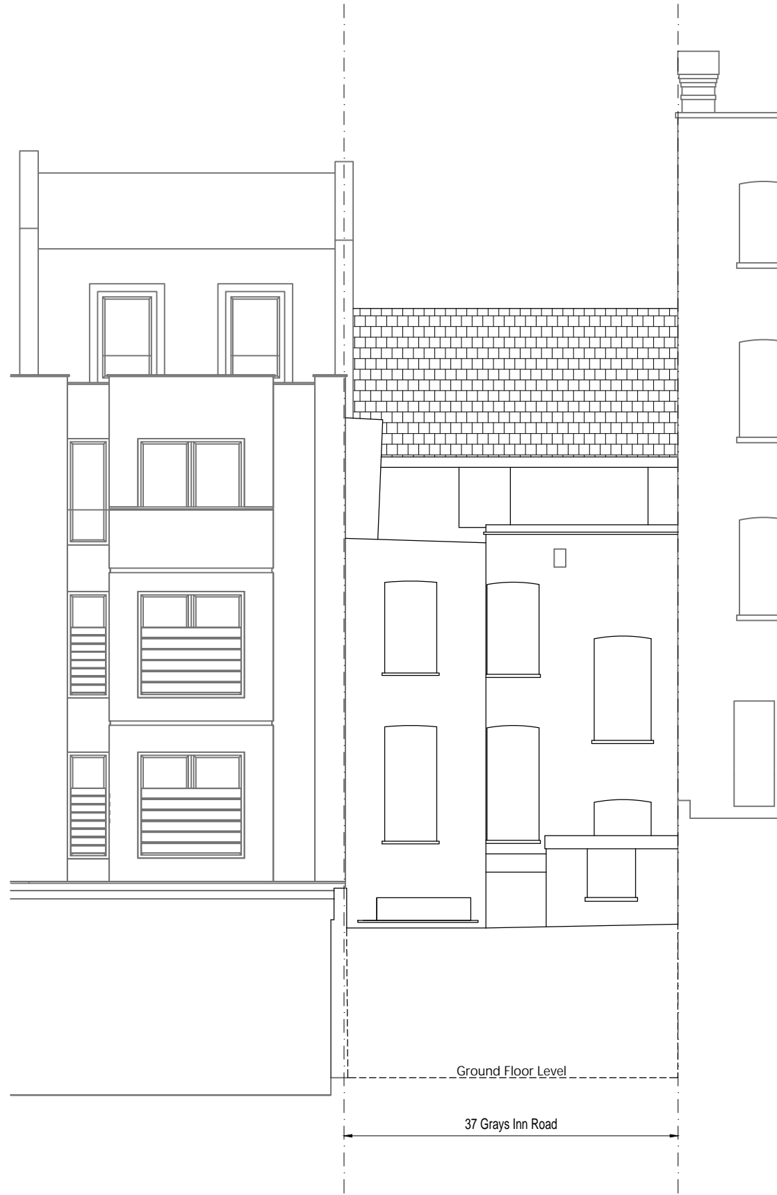
Rear Elevation As Existing