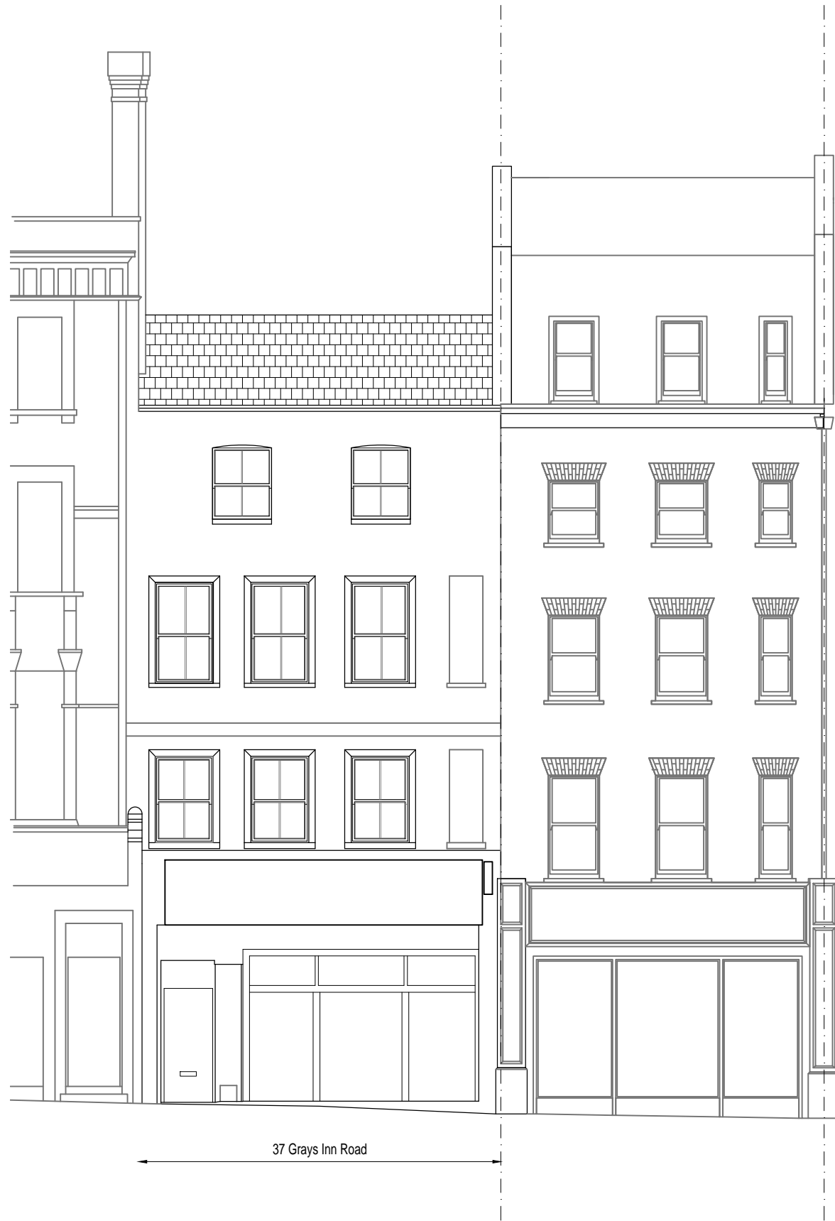
Front Elevation As Existing