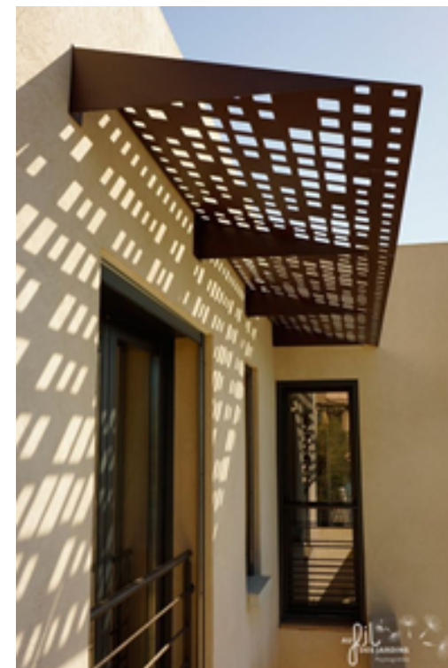
Concept if New Canopy over Door (Image A)

Site Measurements not to be taken from drawings. Contractor to confirm all dimensions. HHD not liable for seeking relevant planning authority permissions (including LBC) unless specifically directed by the client