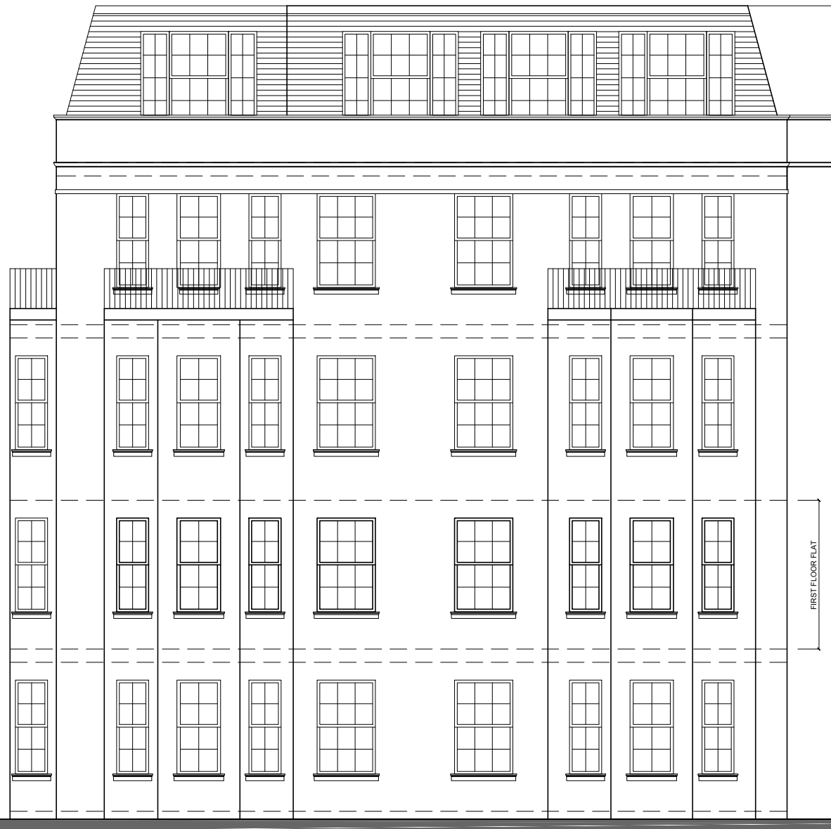
EXISTING NORTH ELEVATION SCALE 1:100