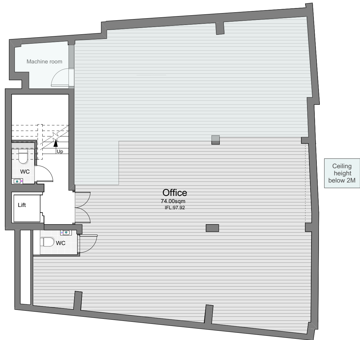
3 Lower Ground Floor Plan - Proposed Scale: 1:100