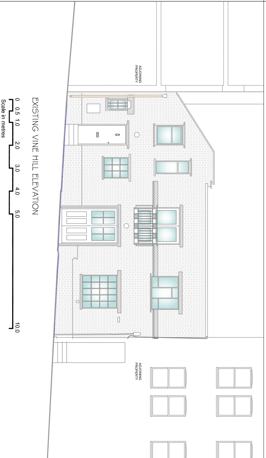
EXISTING VINE HILL ELEVATION Scale in metres

NOTES: No dimensions are to be scaled from this drawing. All dimensions are to be checked on site. Where discrepancy occurs between specification and drawings the supervising officer must be notified.