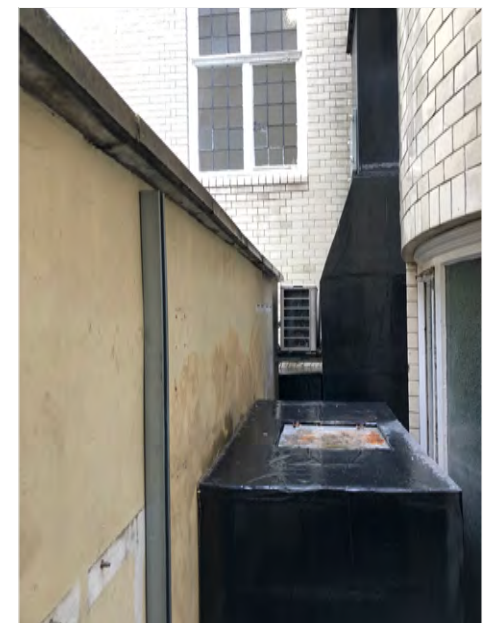
Extract stack as existing