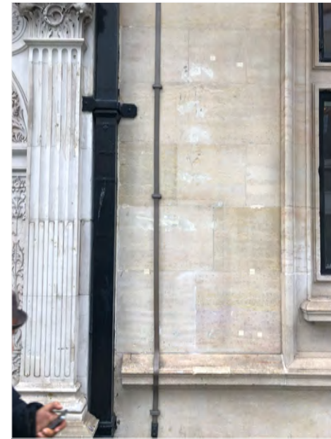
Proposed position of signage