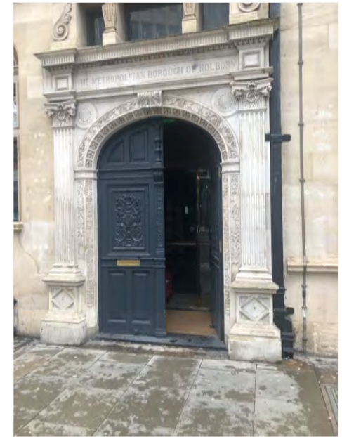
Entrance as existing