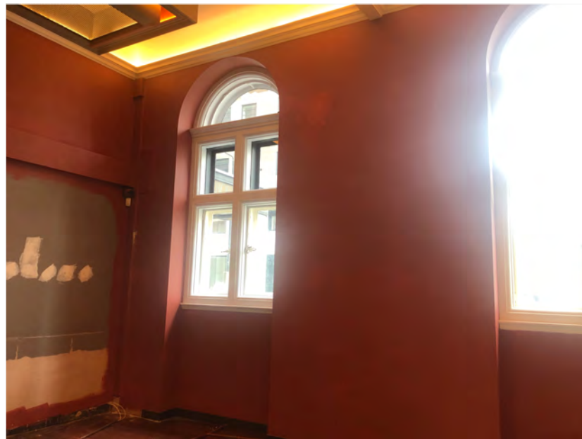
Private dining room as existing