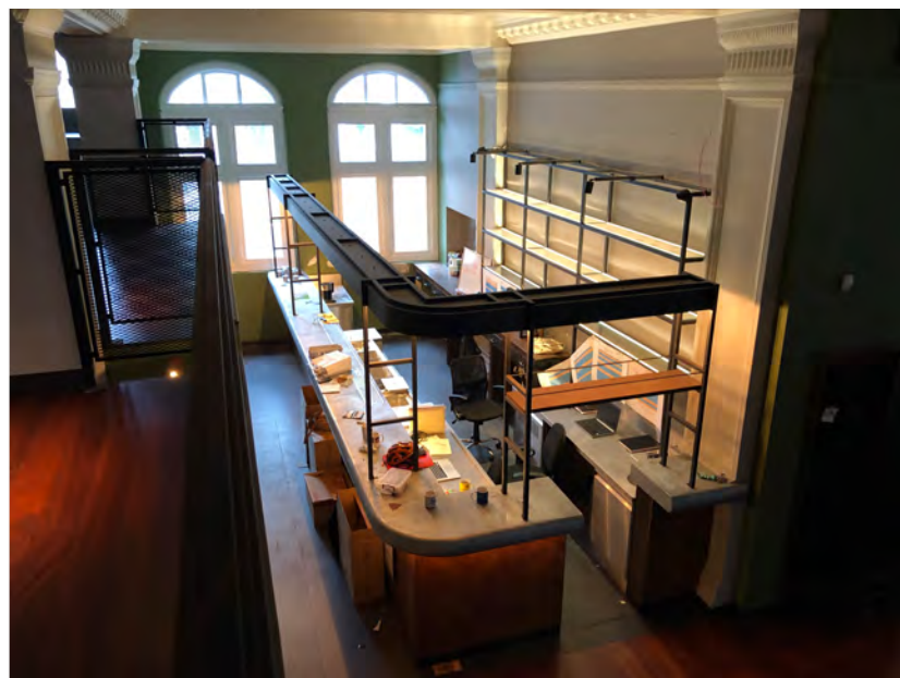
Bar as existing