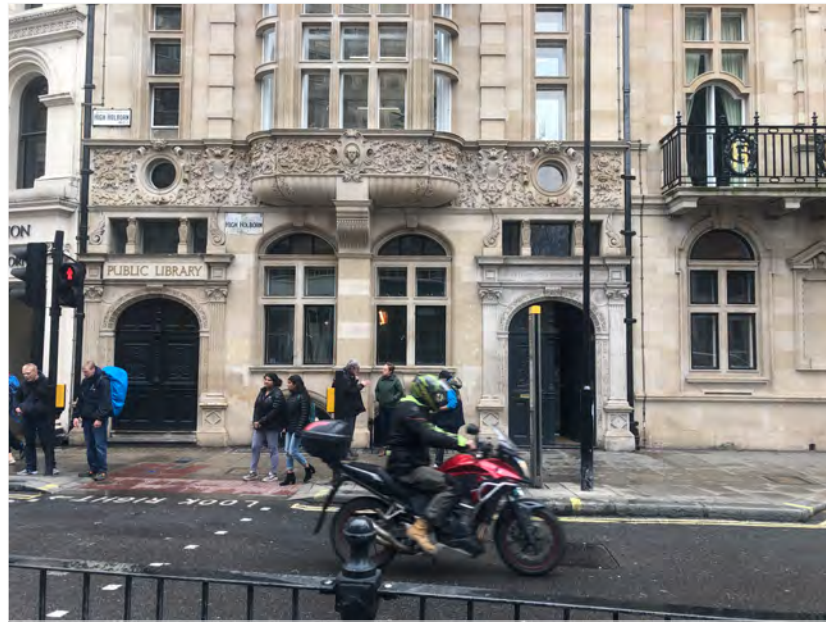
View of existing facade from High Holborn