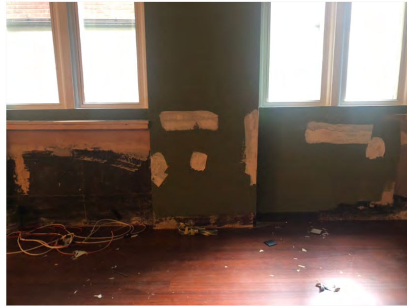
Main restaurant area as existing