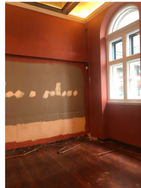
Private dining room as existing