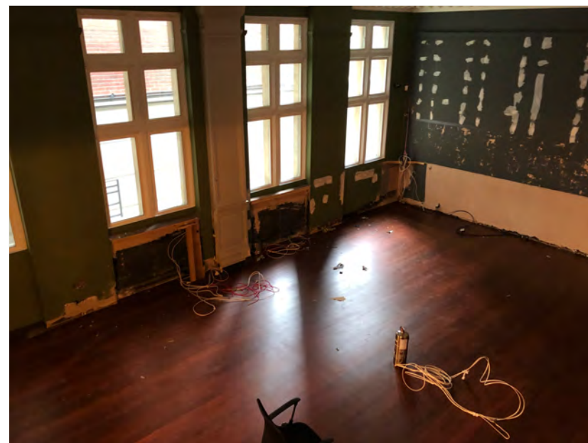
Main restaurant area as existing