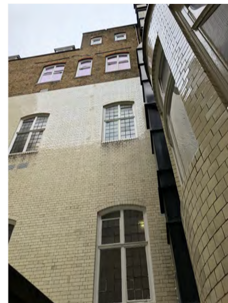
Extract stack as existing