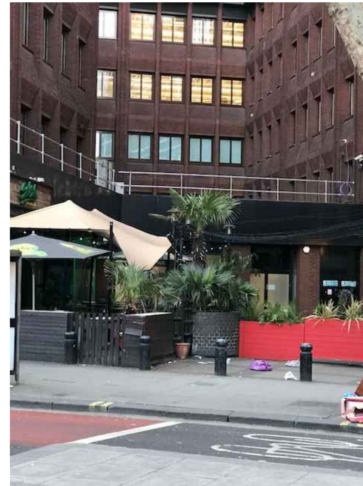
V2 VIEW- LOOKING UP