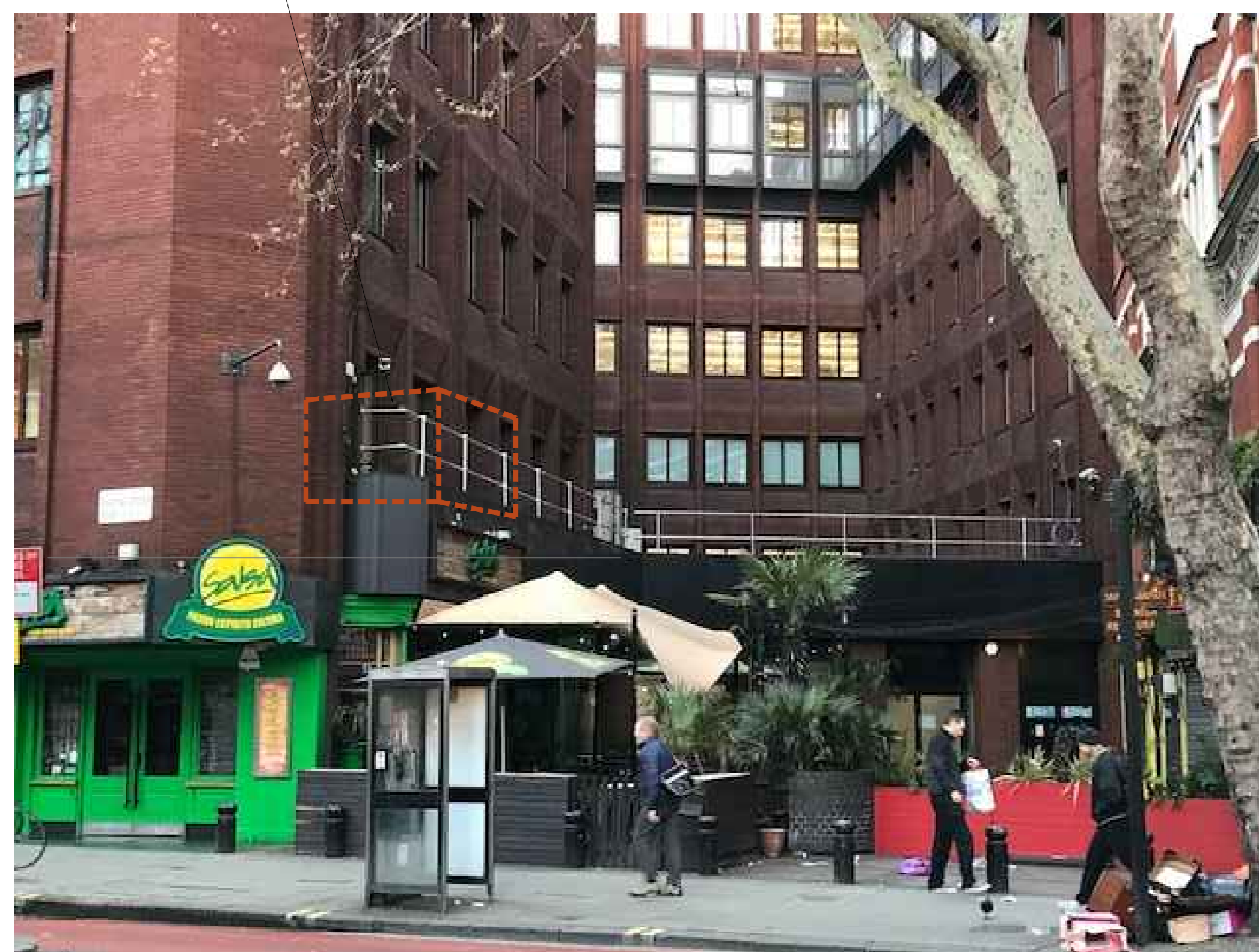
V4 VIEW- LOOKING FROM ACROSS CHARING CROSS

APPROX LOCATION ACOUSTIC ENCLOSURE SET BEHIND MAIN BUILDING