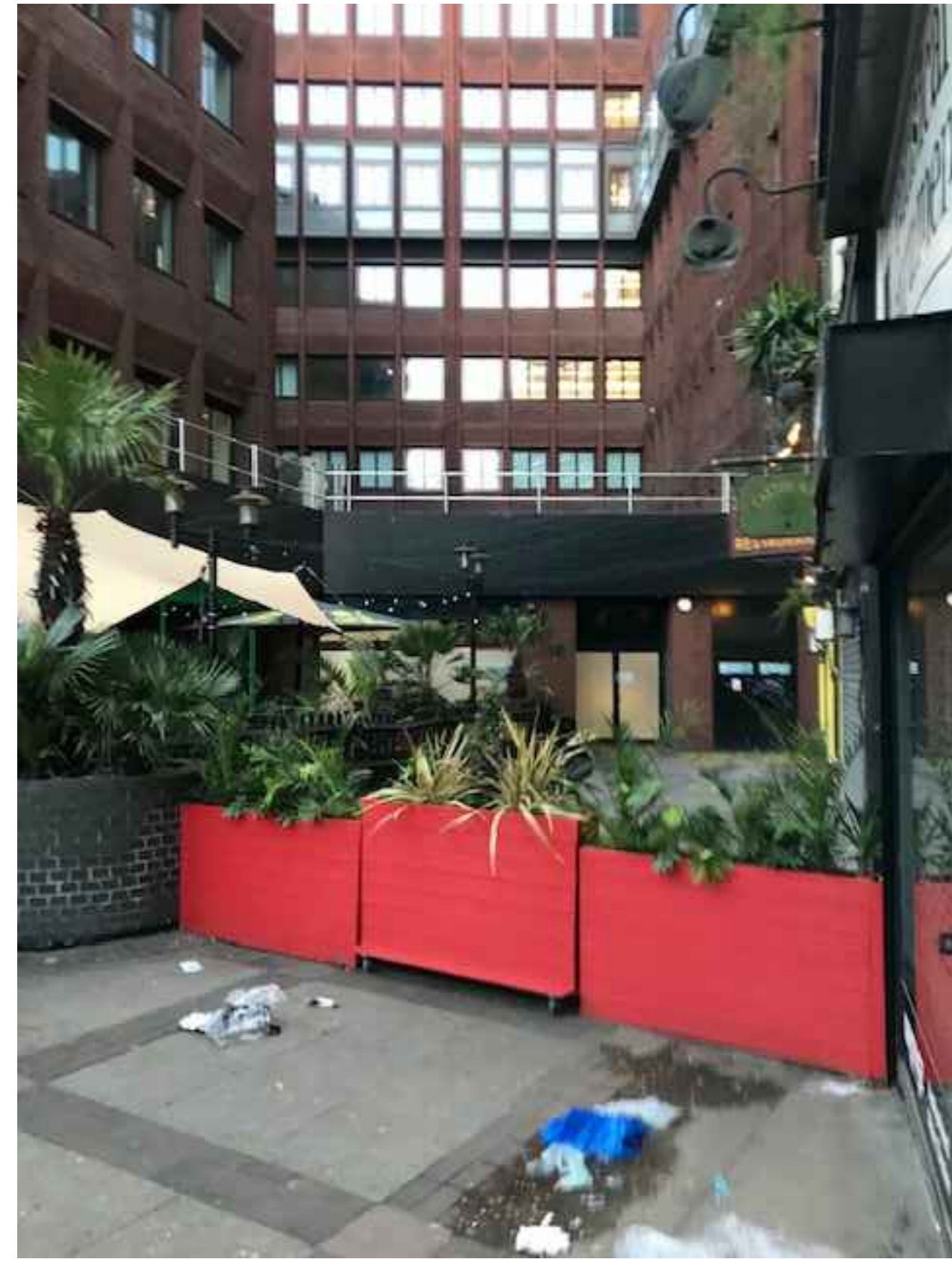
V1 VIEW- LOOKING UP