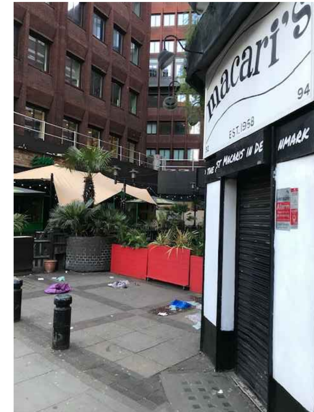
V3 VIEW- LOOKING UP

APPROX LOCATION ACOUSTIC ENCLOSURE SET BEHIND MAIN BUILDING