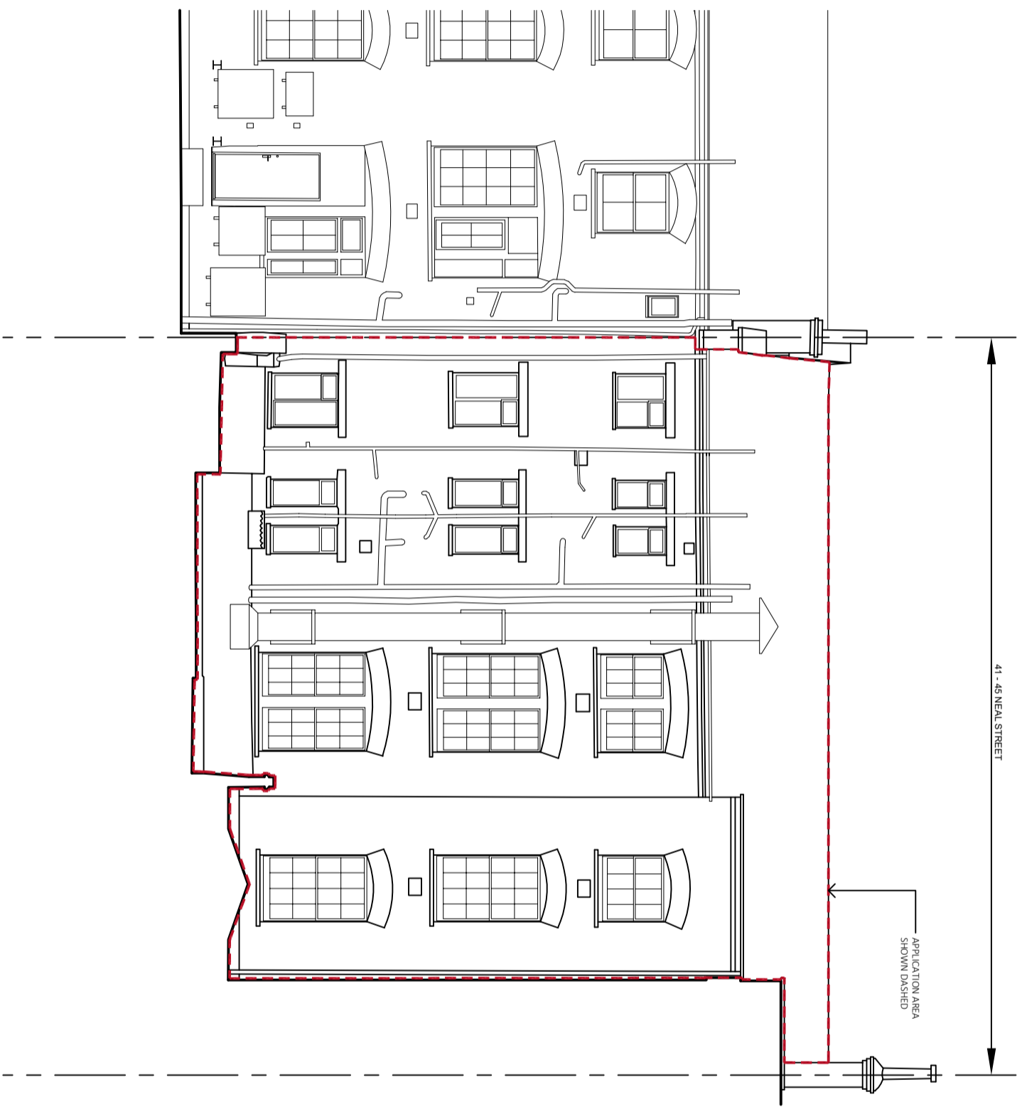
01 EXISTING - REAR ELEVATION 1:100 @ A3

The hard copy accompanying the electronic data is legal transmission of information. The electronic copies are issued only for convenience of use. No responsibility for the accuracy or for any consequence resulting from the use or alteration of information is accepted.