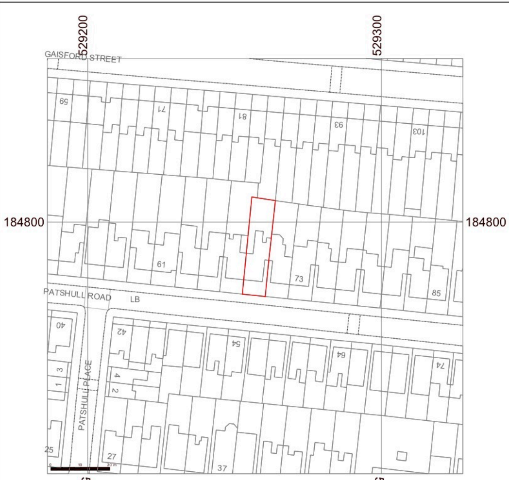
OS Map 1 : 1250