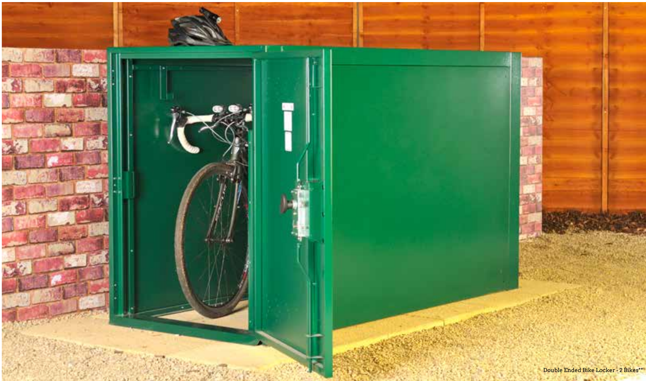
Double Ended Bike Locker - 2 Bikes**