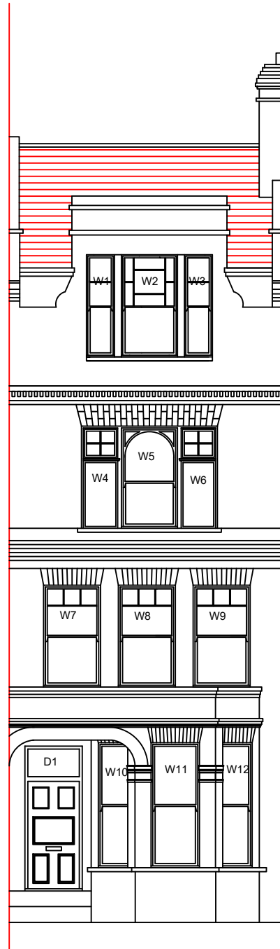
FRONT ELEVATION (Existing)

Existing windows are single glazed timber sash to be replaced.