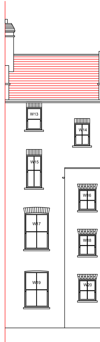
REAR ELEVATION (Existing)

Existing windows are single glazed timber sash to be replaced.