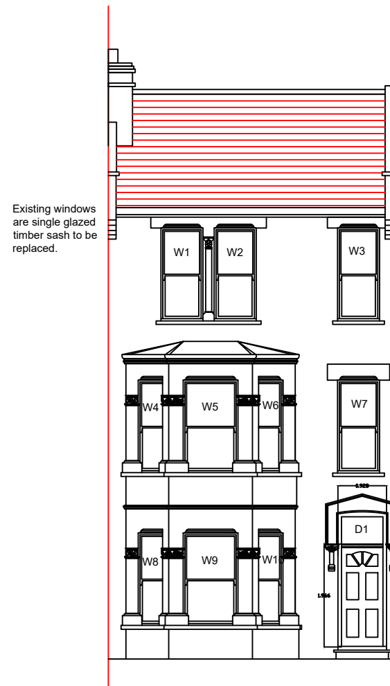
FRONT ELEVATION (Existing)

EXISTING TIMBER SINGLE GLAZED WINDOW TO BE REPLACED