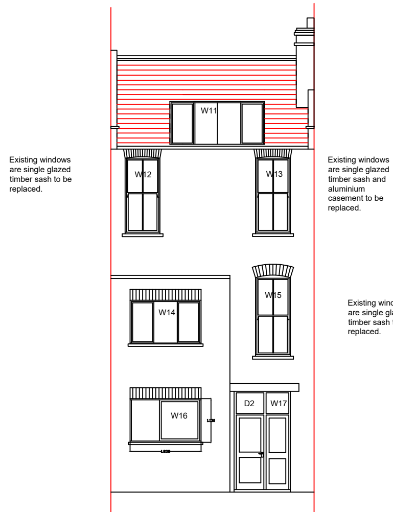
REAR ELEVATION (Existing)

EXISTING TIMBER SINGLE GLAZED WINDOW TO BE REPLACED