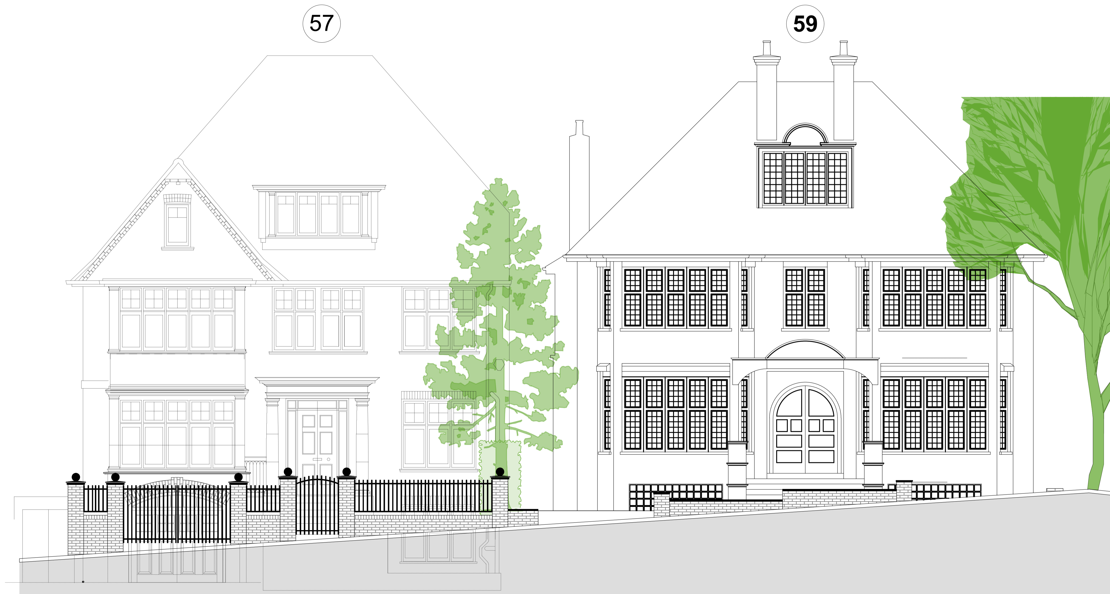
EXISTING FRONT ELEVATION - Nos. 57 & 59 - STREET VIEW