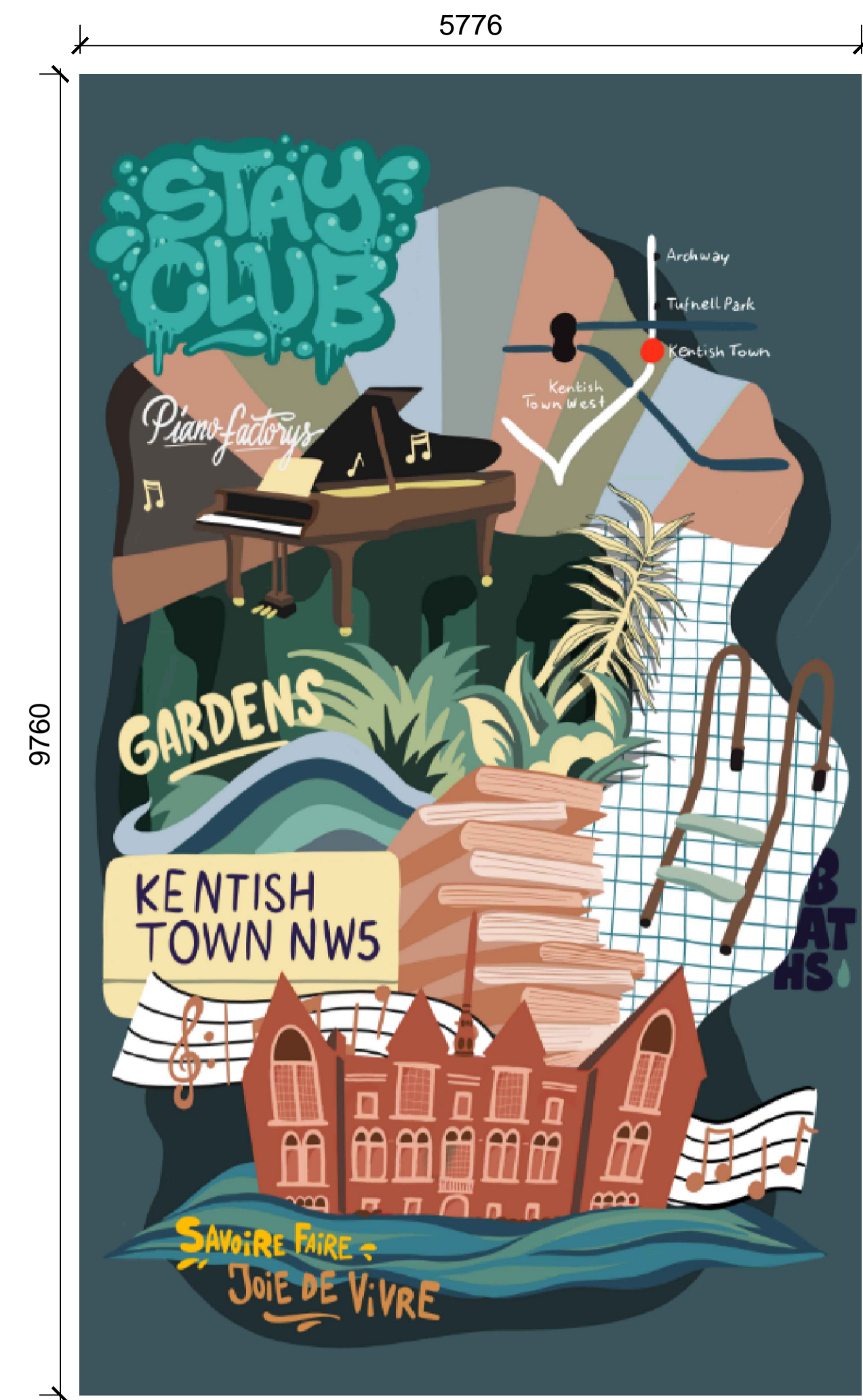
ART WORK / MURAL