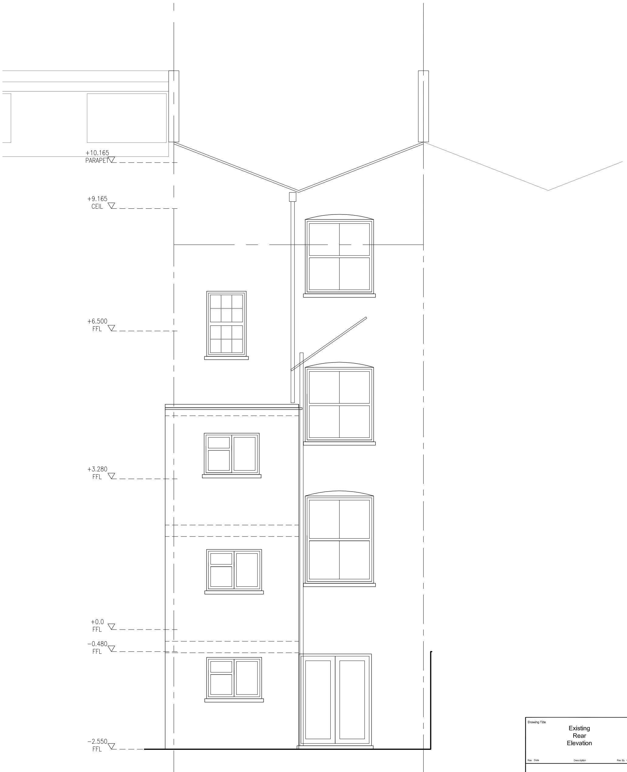
7A EXISTING REAR ELEVATION SCALE 1:50